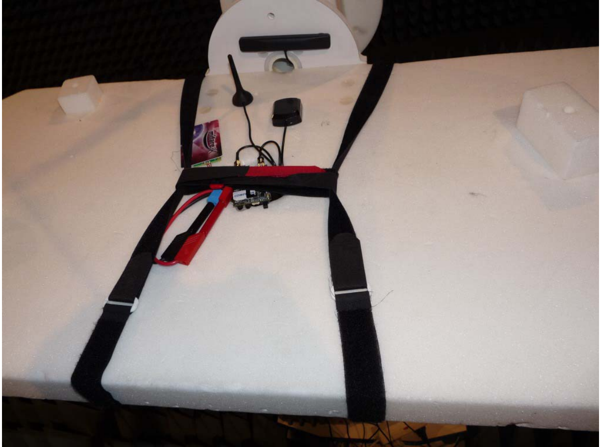
Test setup for radiated measurements