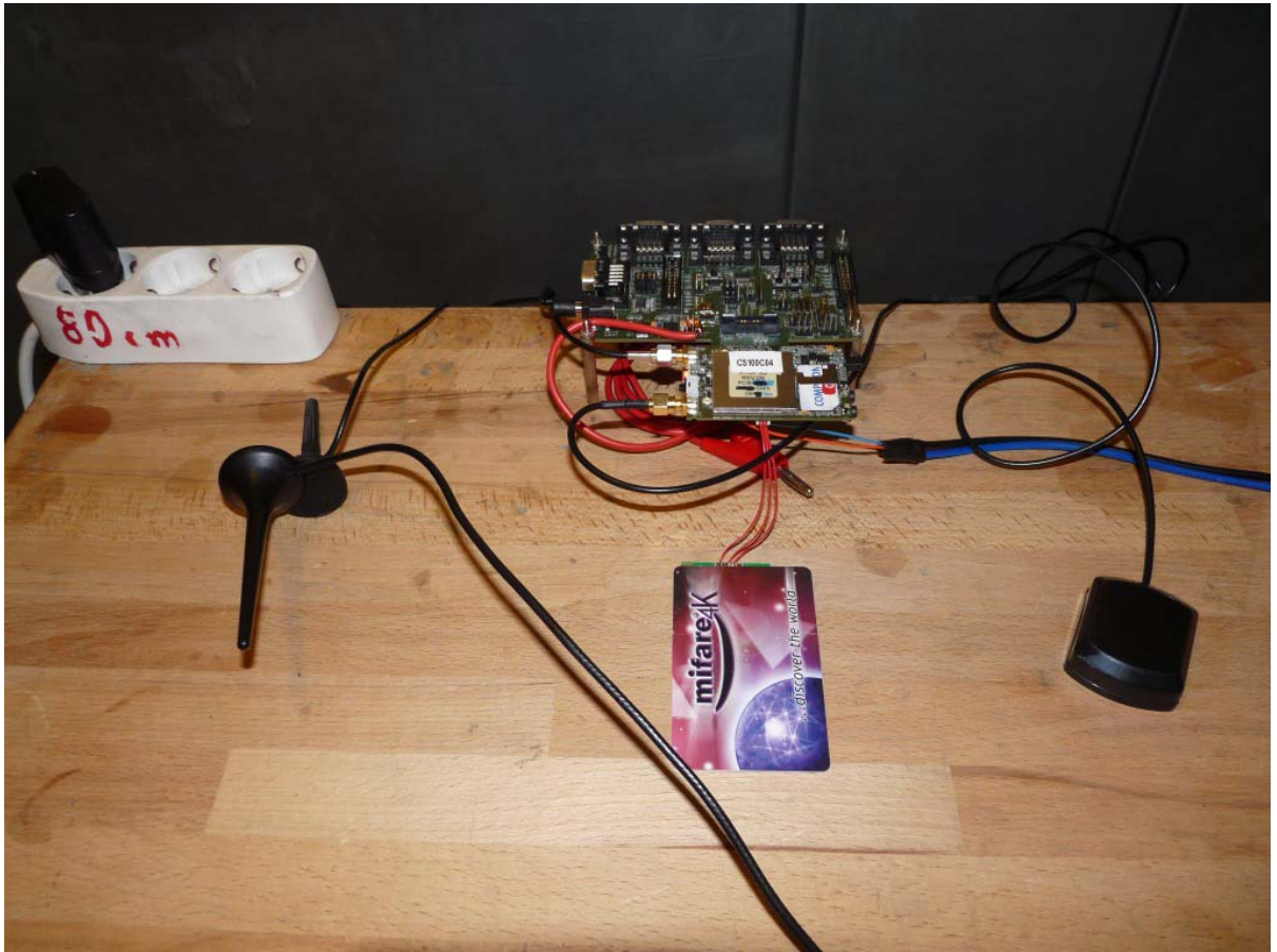
Test setup fo conducted measurements (AC line)