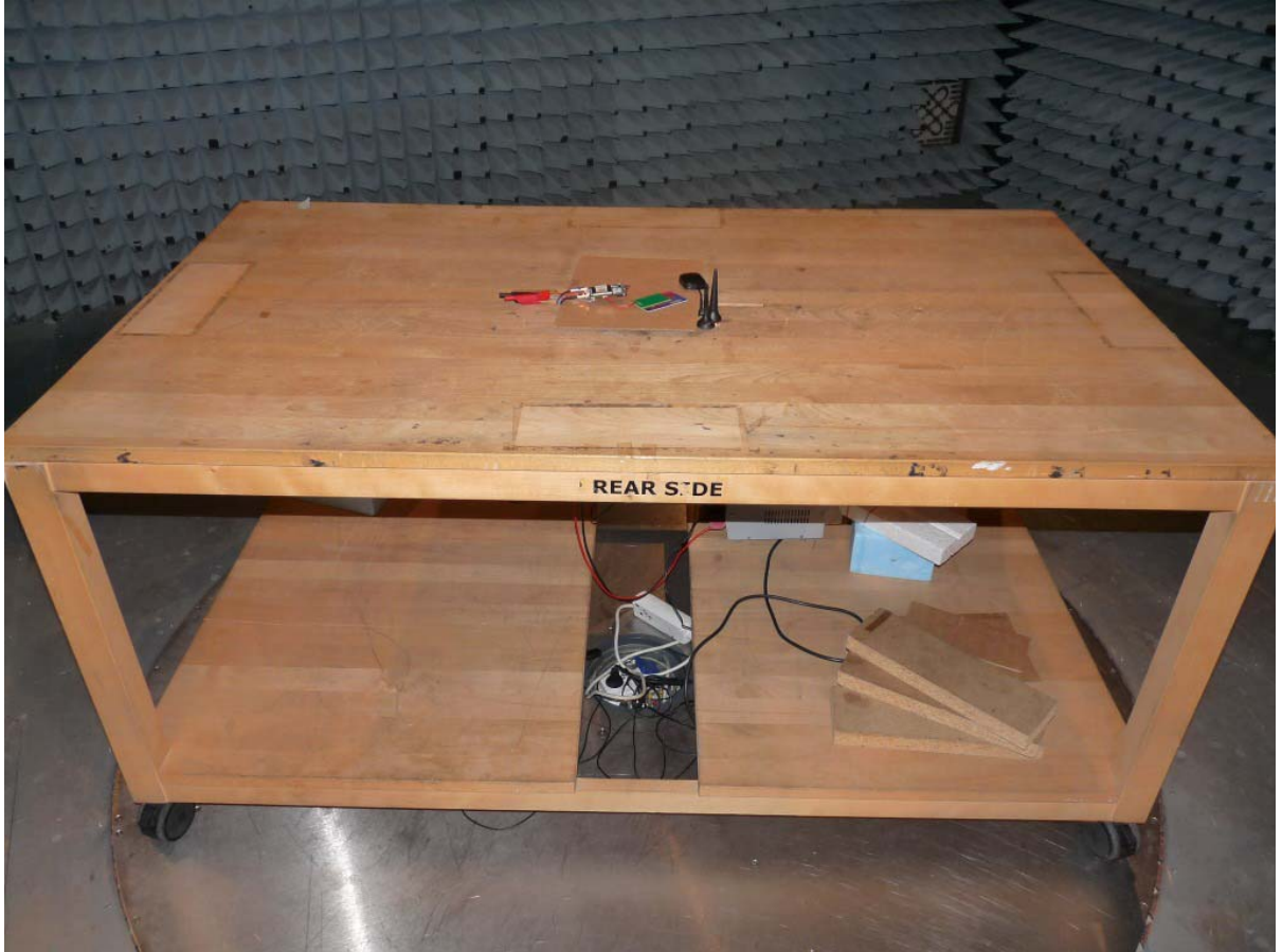
Test setup for radiated measurements