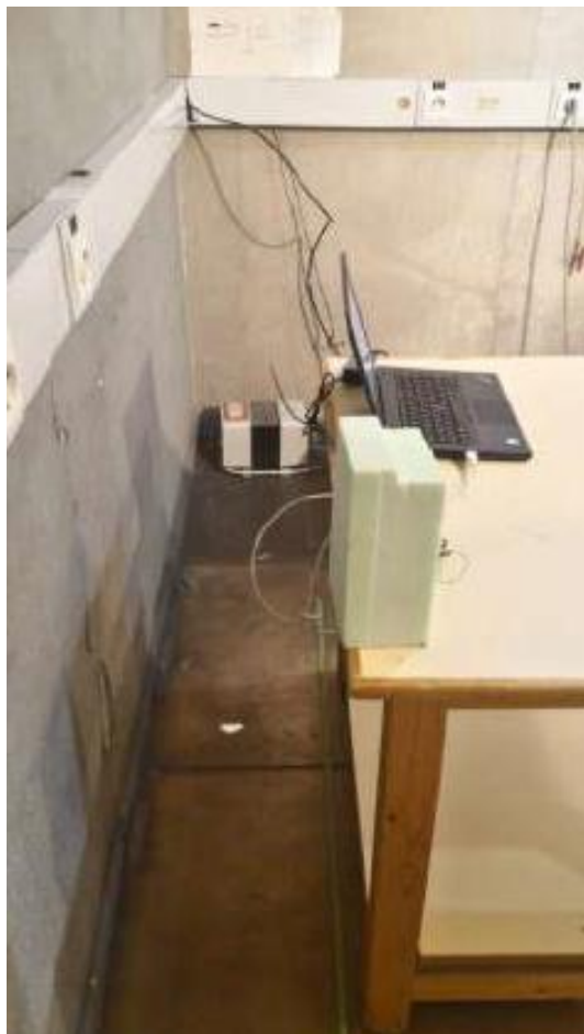
Conducted emission measurement setup (JN5179-001-M13 version)

FCC ID: XXMJN5179M1X IC: 8764A-JN5179M1X