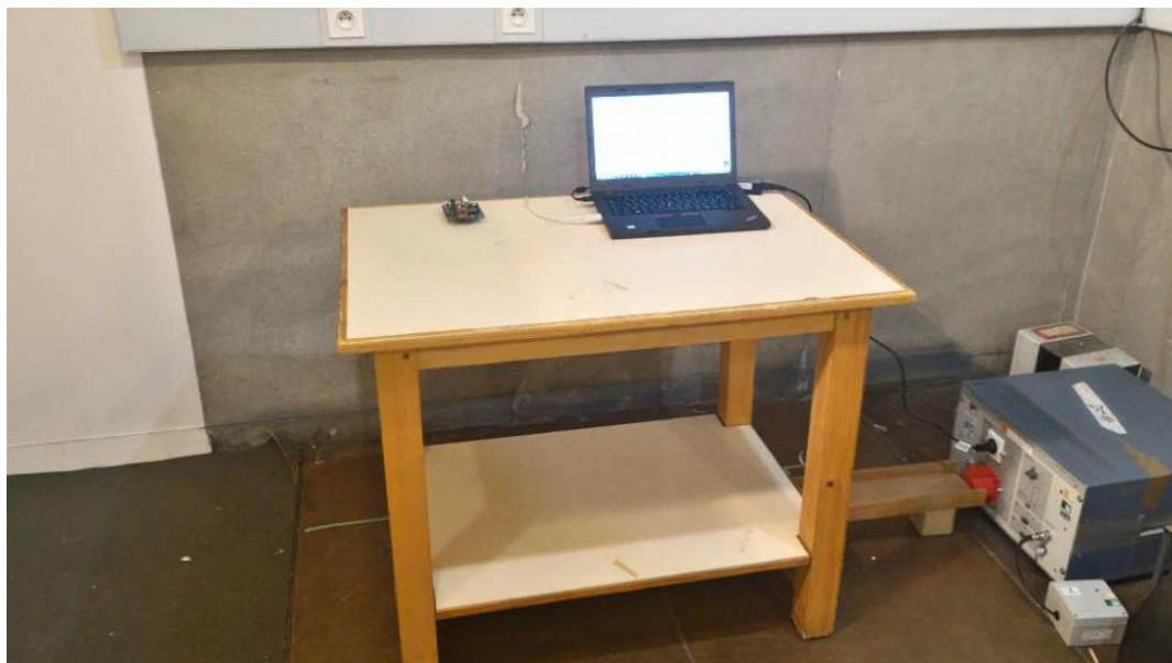
Conducted emission measurement setup (JN5179-001-M10 version)

NXP Semiconductors JN5179-001-M10 & JN5179-001-M13