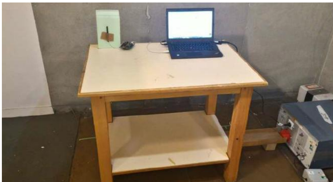
Conducted emission measurement setup (JN5179-001-M13 version)