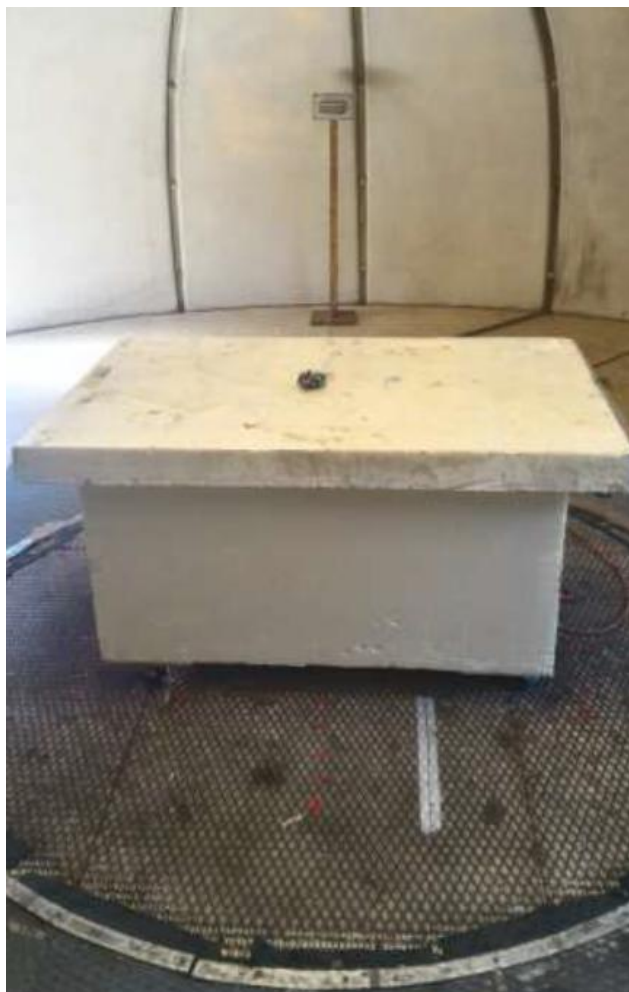
Radiated emissions measurements setup below 1GHz (JN5179-001-M10 version)

FCC ID: XXMJN5179M1X IC: 8764A-JN5179M1X