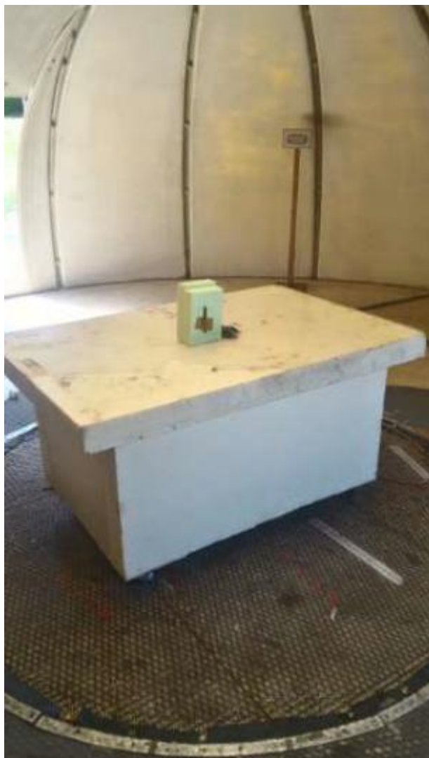
Radiated emissions measurements setup below 1GHz (JN5179-001-M13 version)

FCC ID: XXMJN5179M1X IC: 8764A-JN5179M1X