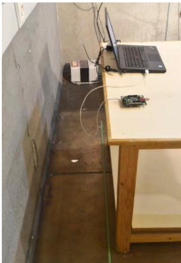
Conducted emission measurement setup (JN5179-001-M10 version)

FCC ID: XXMJN5179M1X IC: 8764A-JN5179M1X