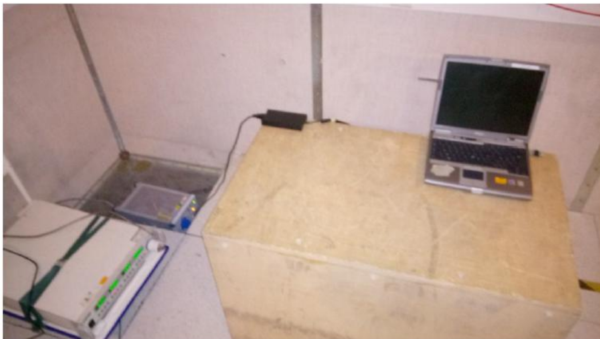
Conducted emission measurement setup