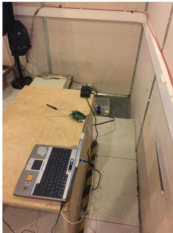
Conducted emission measurements