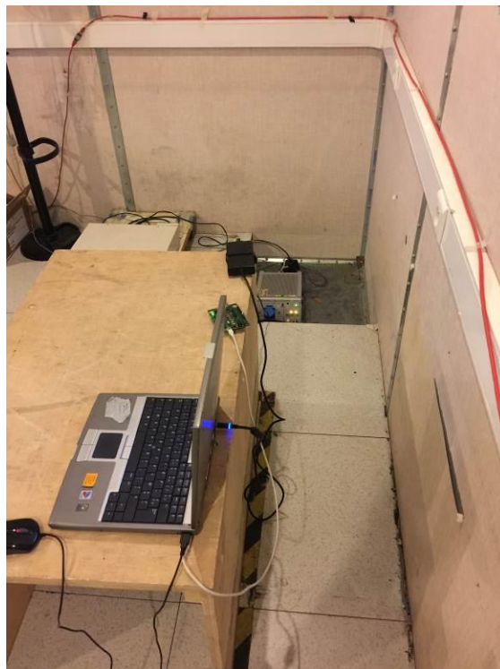
Conducted emission measurements