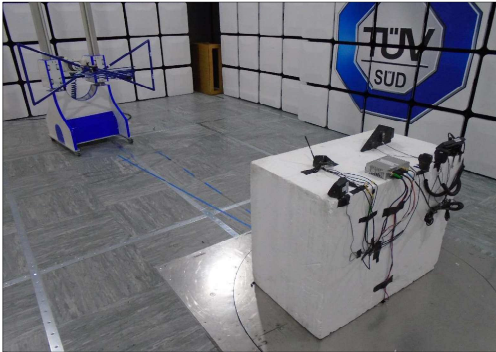
Figure 6 - Test Setup - Below 1 GHz