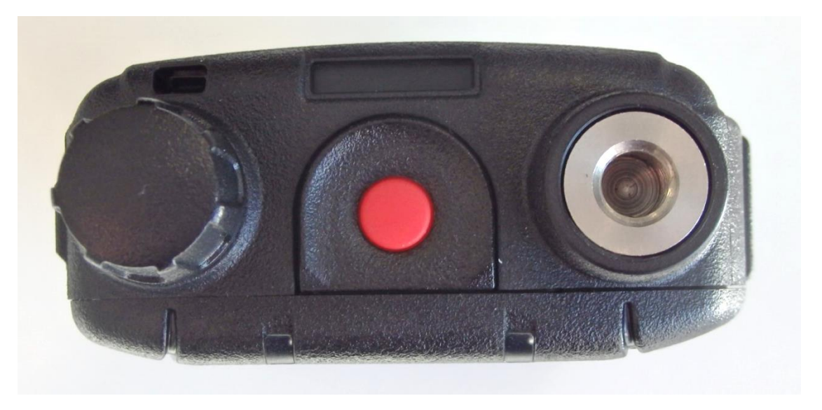
Figure 5. SC21 Series Underside with Battery Removed

Figure 4. SC21 Series Top with Battery and Antenna Removed