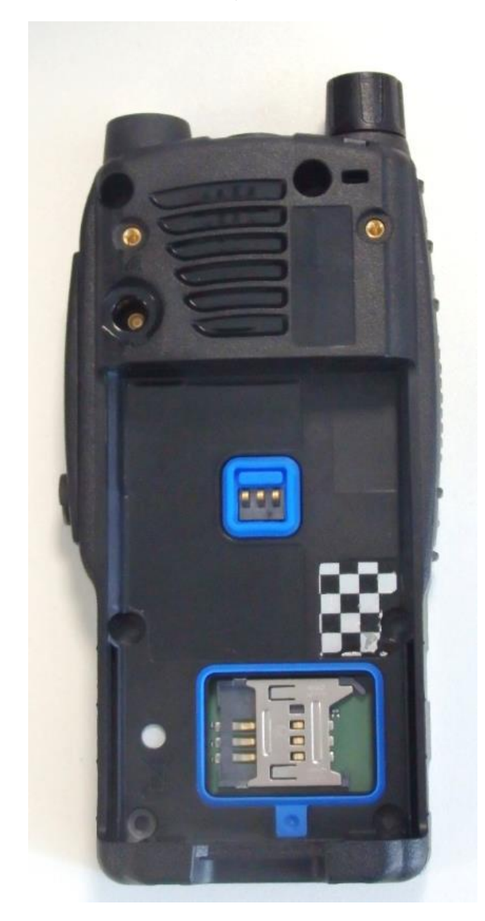
Figure 3. SC21 Series Rear with Battery and Antenna Removed