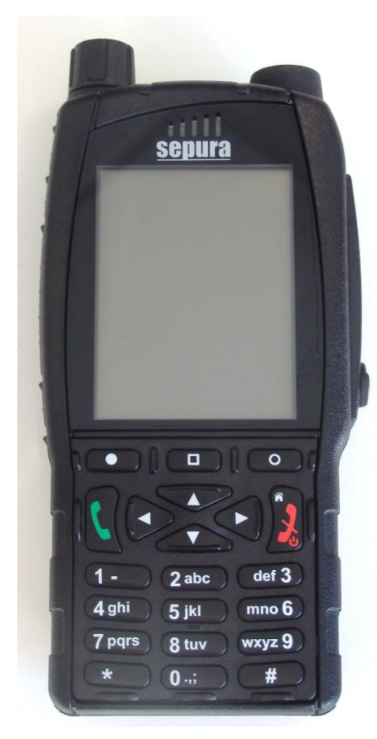
Figure 2. SC21 Series Front with Battery and Antenna Removed