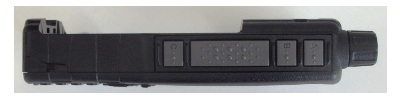
Figure 7. SC21 Series RAC Side with RAC Cover. Battery and Antenna Removed