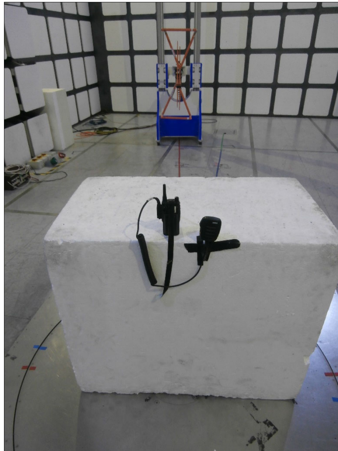
Figure 23 - 30 MHz to 1 GHz - Y Orientation