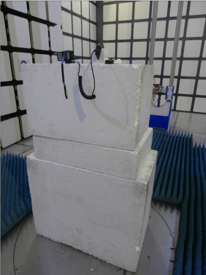
Figure 27 - 1 GHz to 18 GHz - Z Orientation