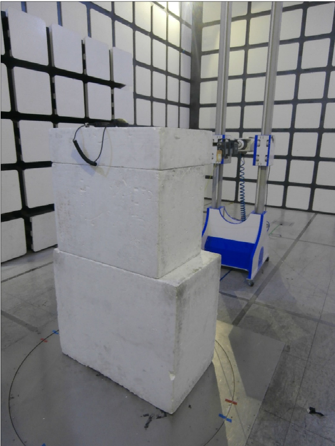
Figure 22 - 18 GHz to 25 GHz - X Orientation