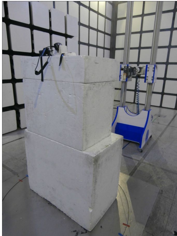
Figure 28 - 18 GHz to 25 GHz - Z Orientation