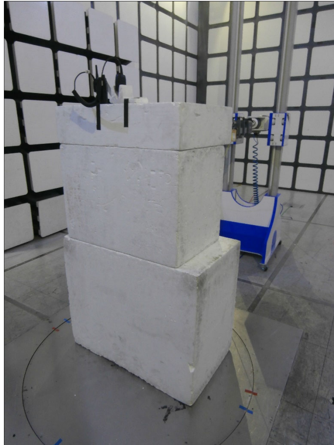
Figure 25 - 18 GHz to 25 GHz - Y Orientation