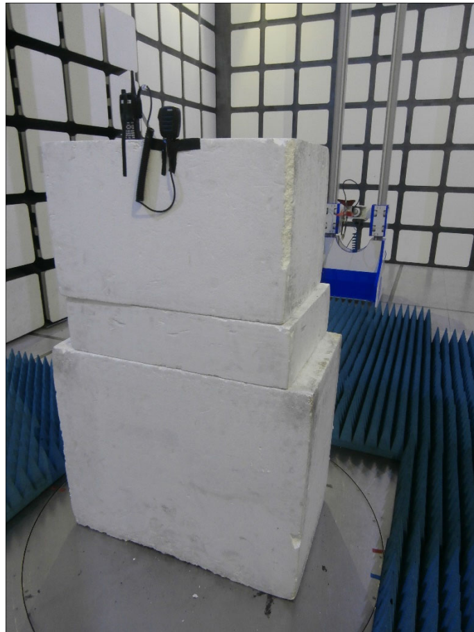
Figure 24 - 1 GHz to 18 GHz - Y Orientation