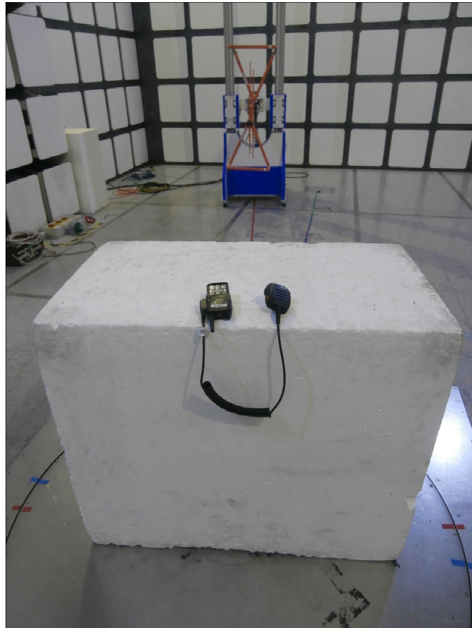
Figure 20 - 30 MHz to 1 GHz - X Orientation