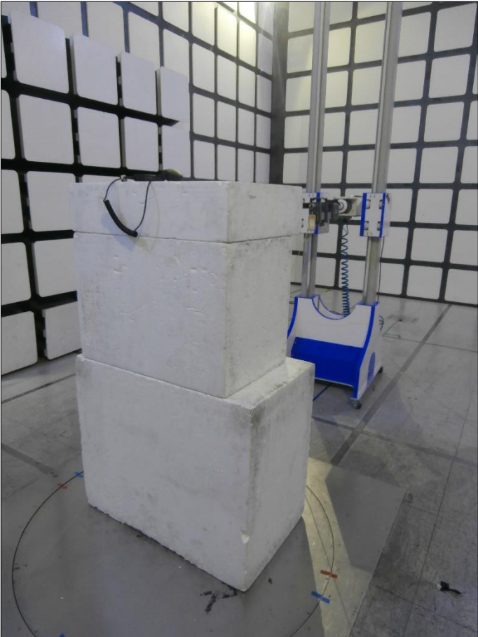
Figure 109 - 18 GHz to 25 GHz - Orientation X