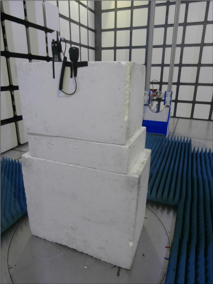
Figure 106 - 1 GHz to 18 GHz - Orientation Y