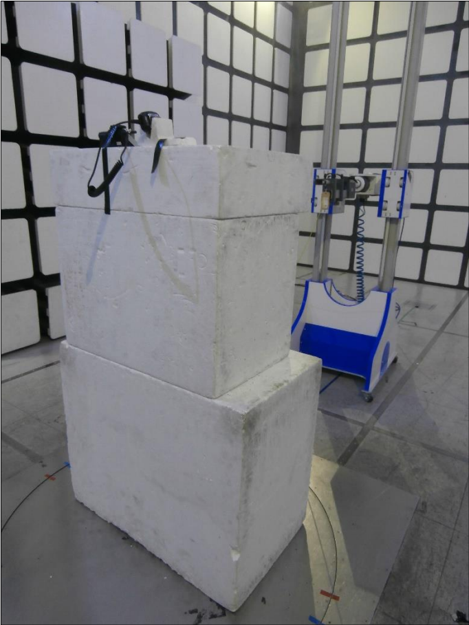
Figure 112 - 18 GHz to 25 GHz - Orientation Z