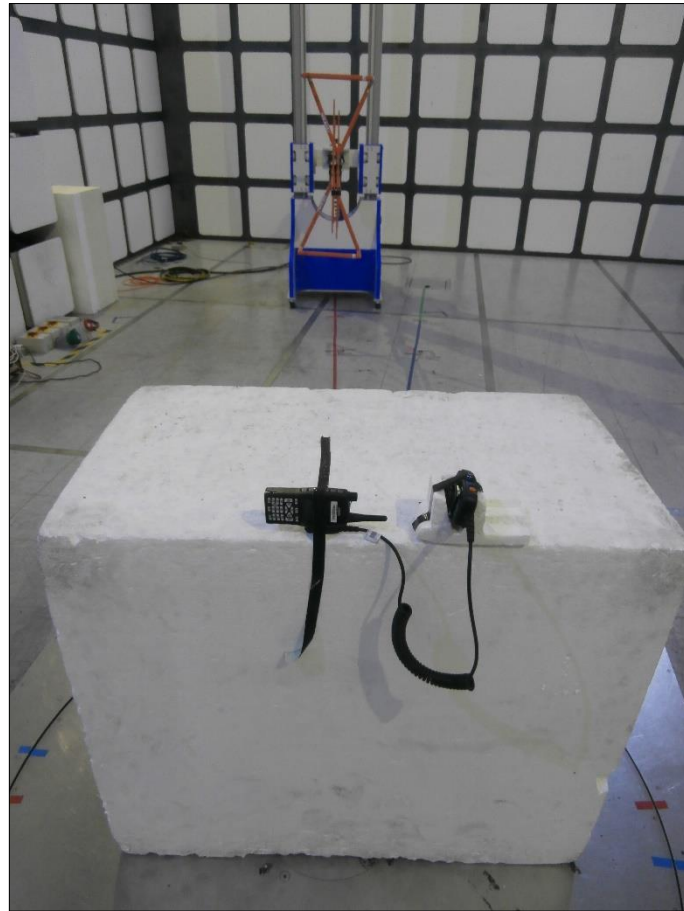
Figure 110 - 30 MHz to 1 GHz - Orientation Z