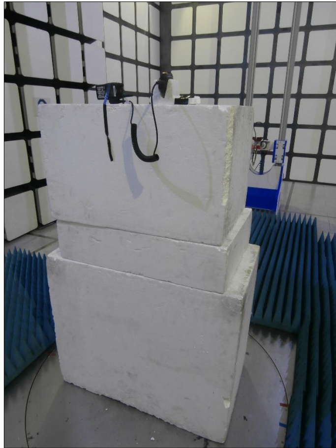
Figure 111 - 1 GHz to 18 GHz - Orientation Z