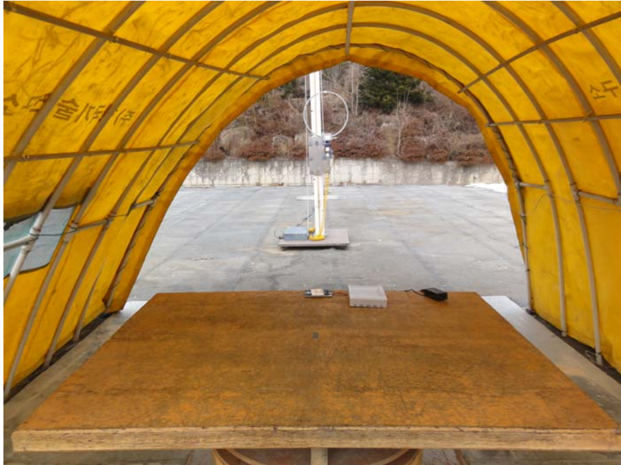
Photograph 1 : Setup for radiated Emissions (below 30 MHz)