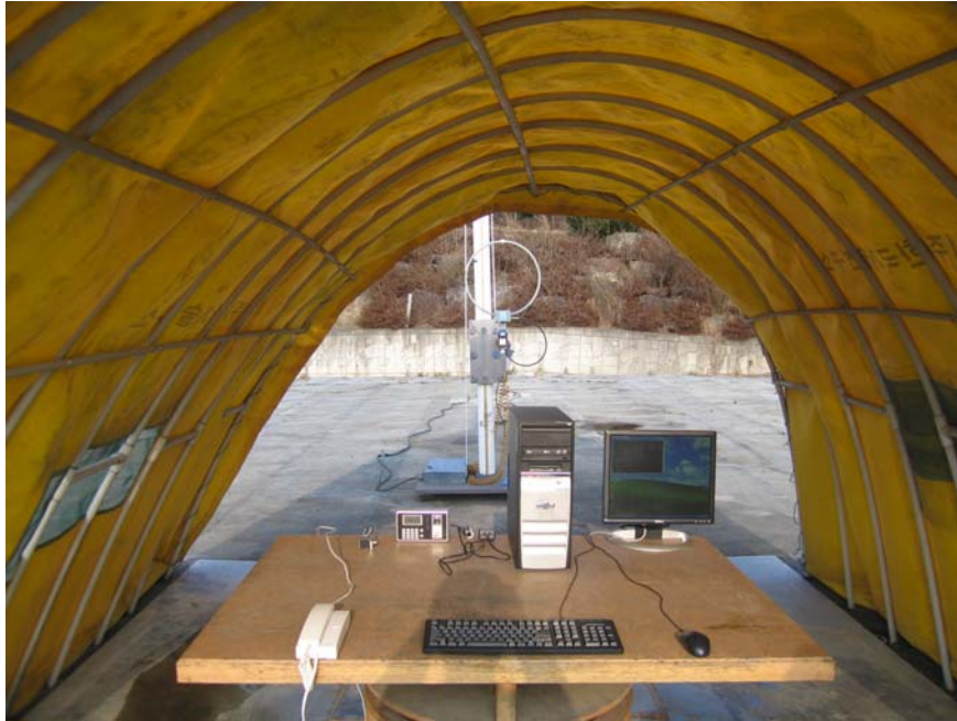
Photograph 1 : Setup for radiated Emissions (below 30 MHz)