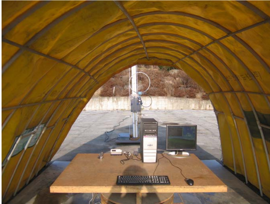
Photograph 1 : Setup for radiated Emissions (below 30 MHz)