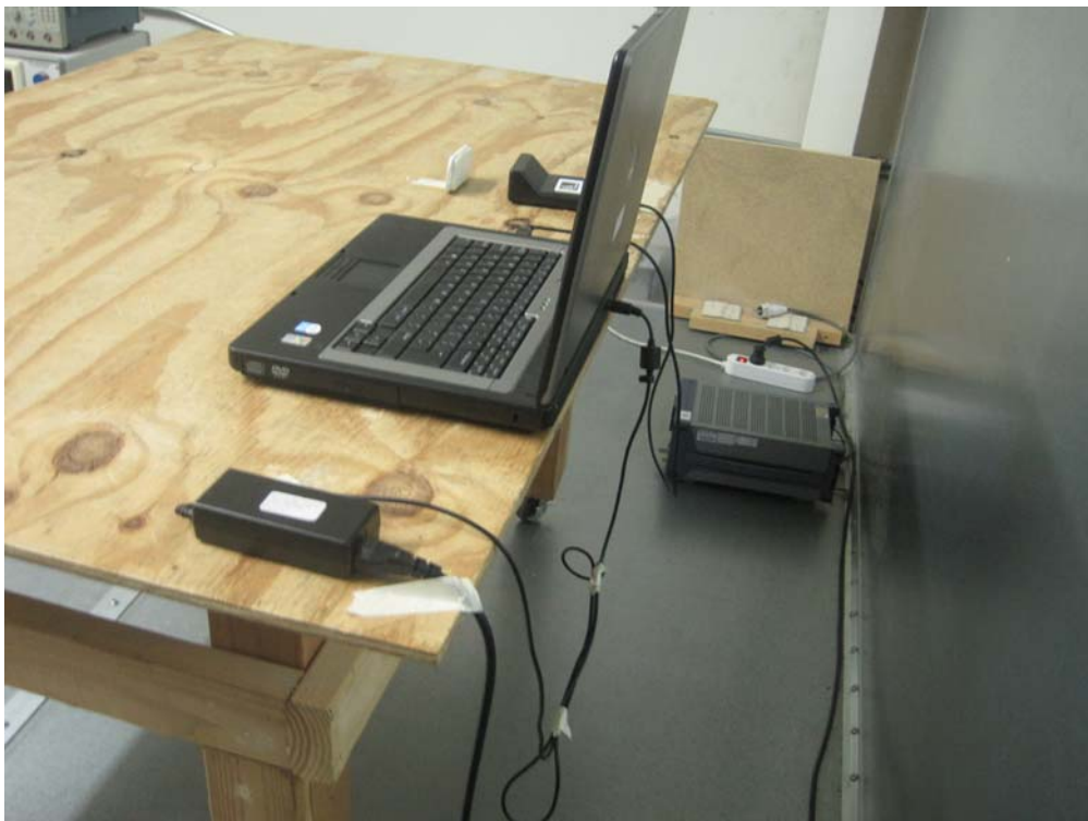
Conducted Emission Rear View