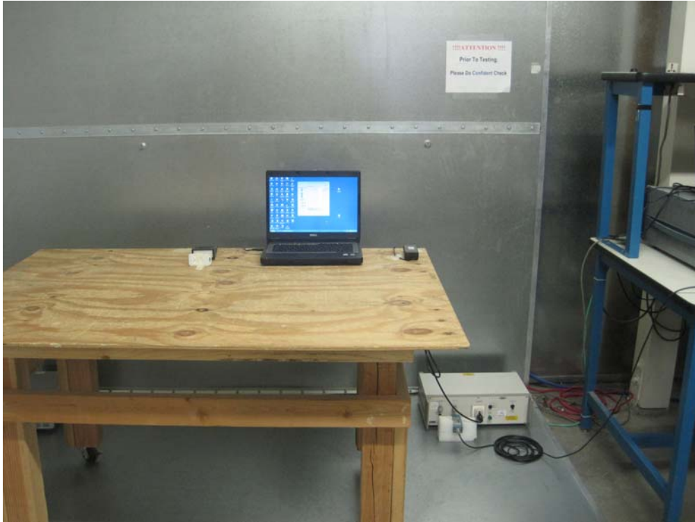
Conducted Emission Front View