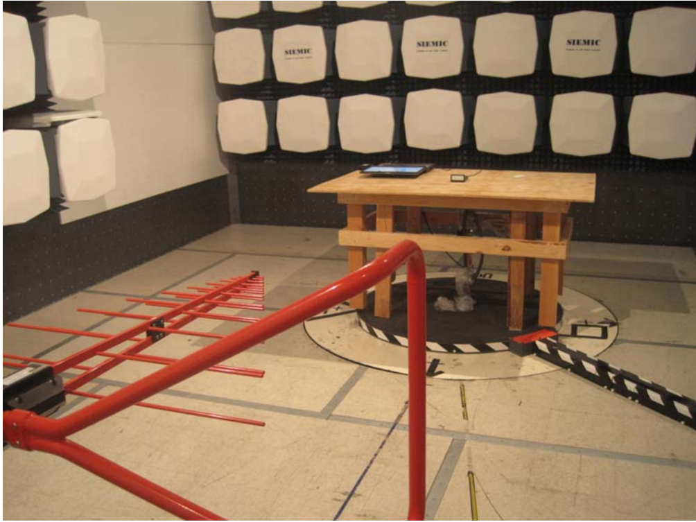
Radiated Emission View (>30MHz)