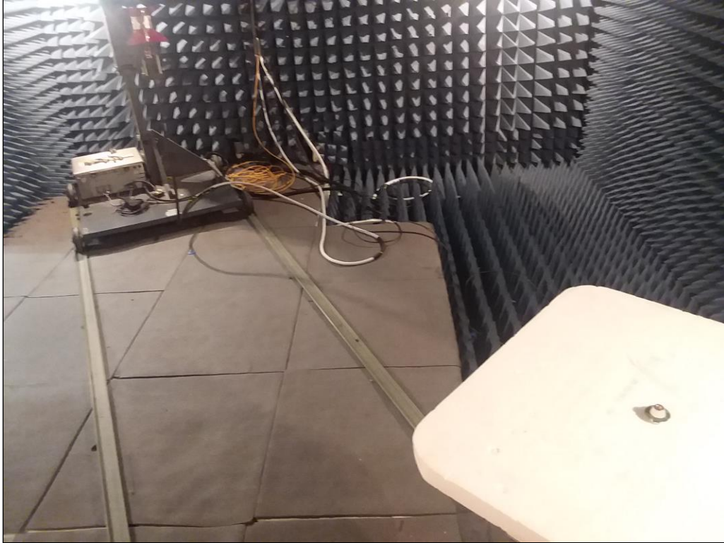
Photograph 1. Radiated Emissions Above 1 GHz, 1- 18 GHz, Test Setup