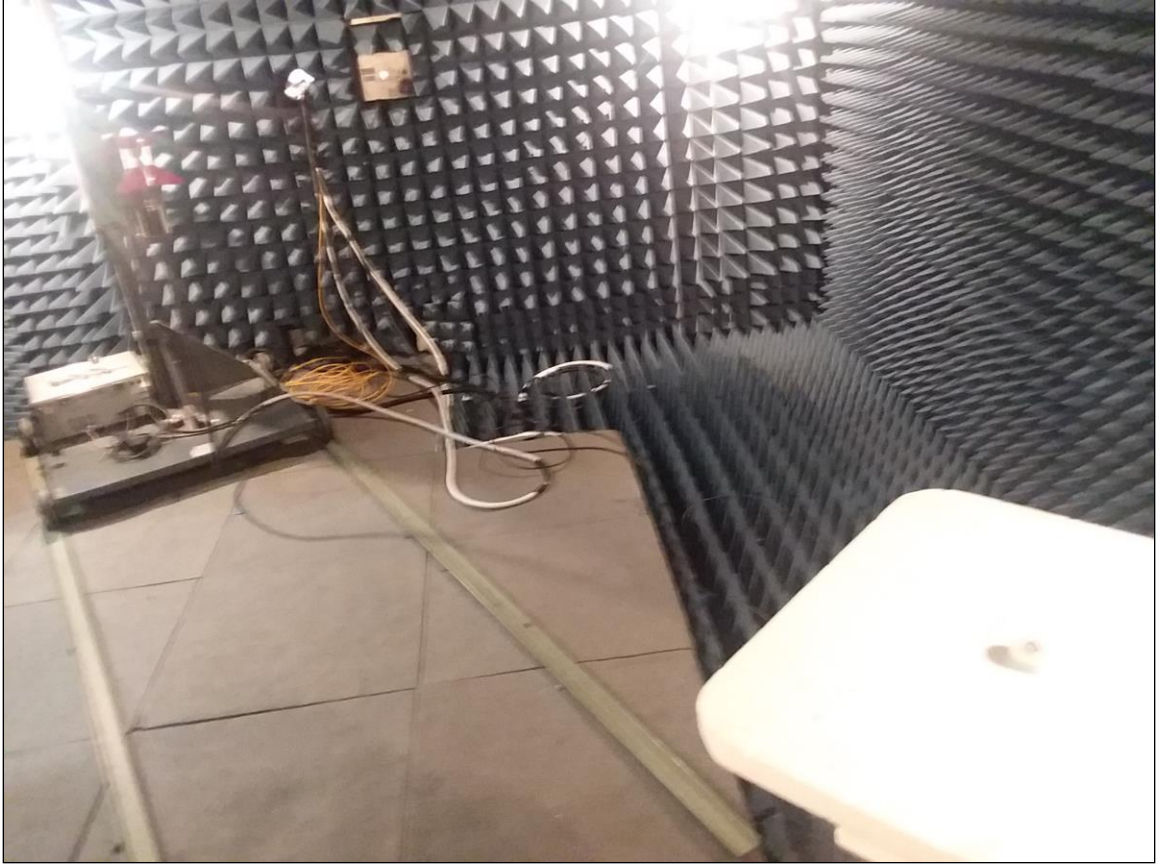
Photograph 1. Radiated Emissions above 1GHz, Test Setup