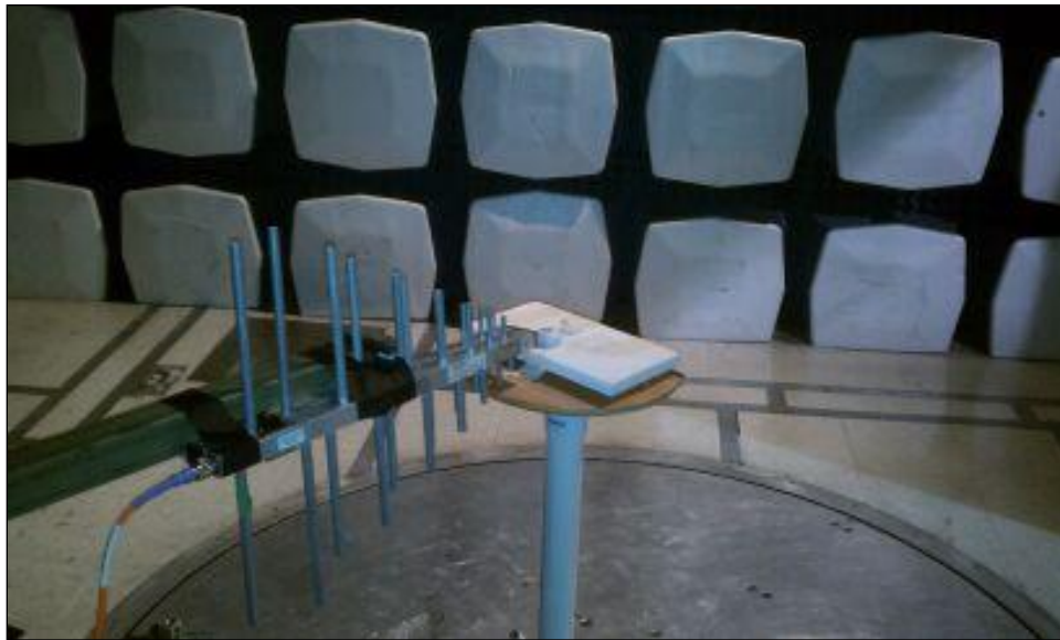
Photograph 2. 15.250(d)(1) Radiated Emissions, Test Setup, 960 MHz – 1 GHz