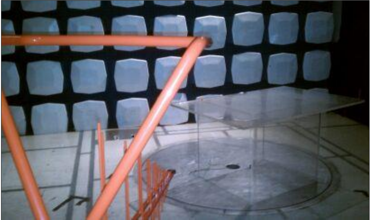
Photograph 1. Radiated Emissions, Test Setup