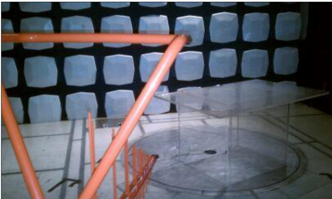
Photograph 5. Radiated Emissions, Test Setup, Below 1 GHz