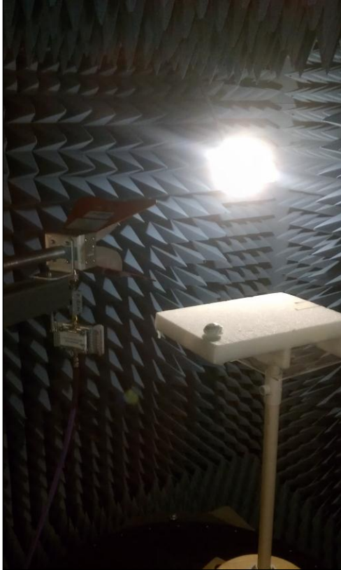
Photograph 3. 15.250(d)(1) Radiated Emissions, Test Setup, Above 1 GHz