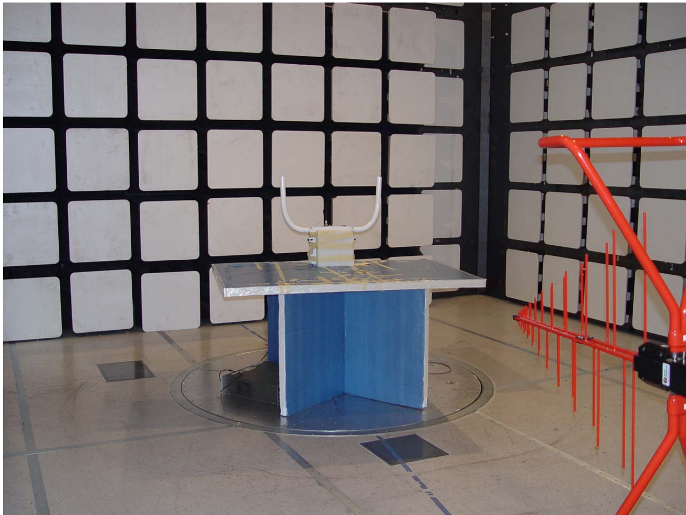
WhereLAN III Location Sensor, model# LOS-5000, < 1GHz

Zebra Enterprise Solutions Corp. WhereLAN III Location Sensor, model# LOS-5000 FCC ID: XWX-LOS5000 IC: 8701A-LOS5000