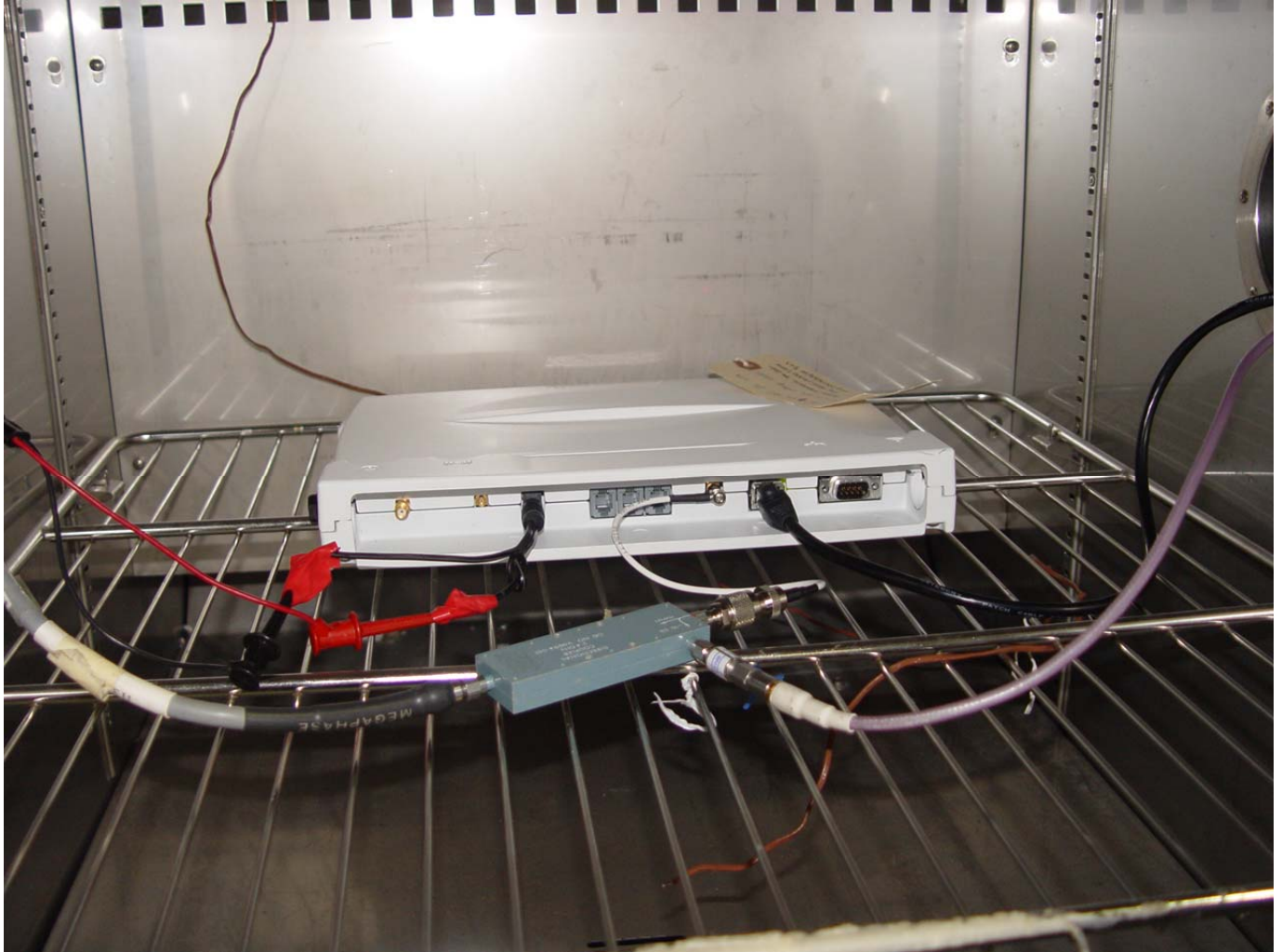
WhereLAN III Location Sensor, model# LOS-5000, conducted RF measurements