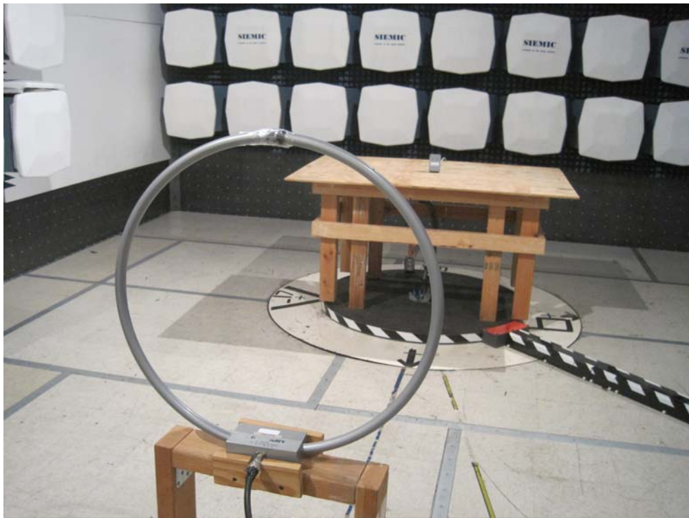
Radiated Emission View (< 30Mhz)