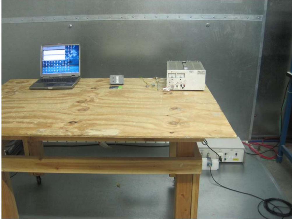
DC Line Conducted Emission Front View