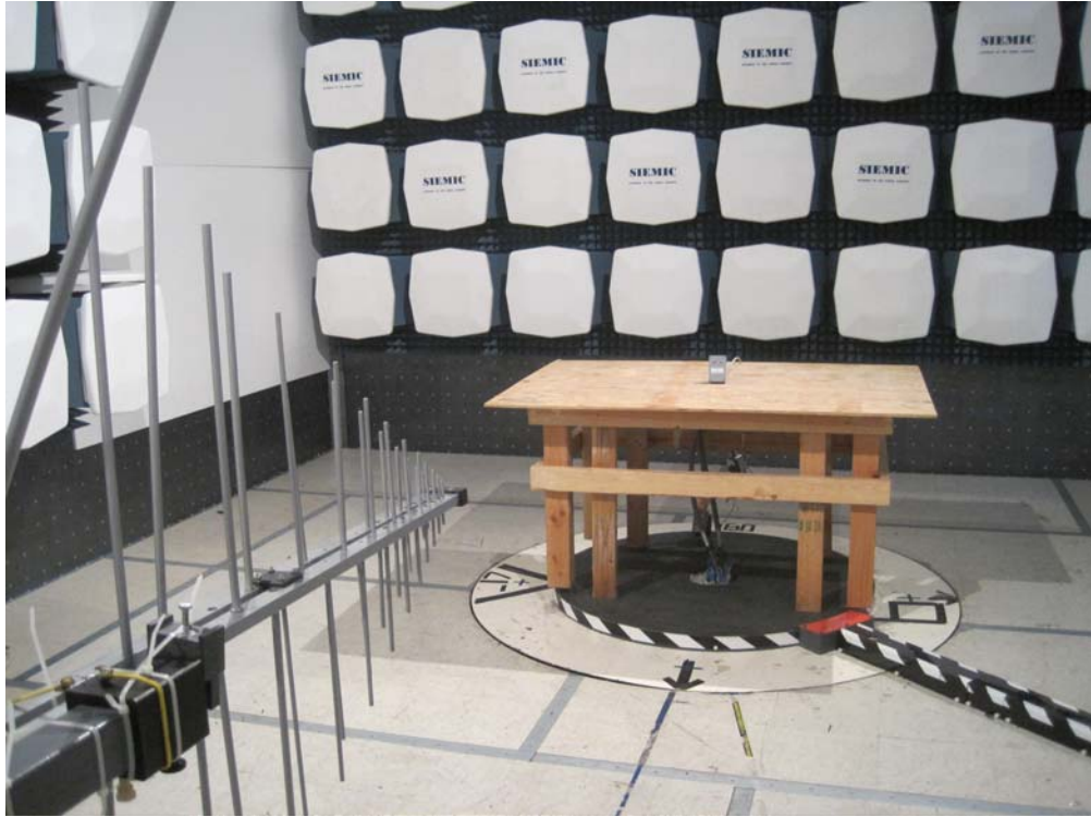
Radiated Emission View (>30MHz)