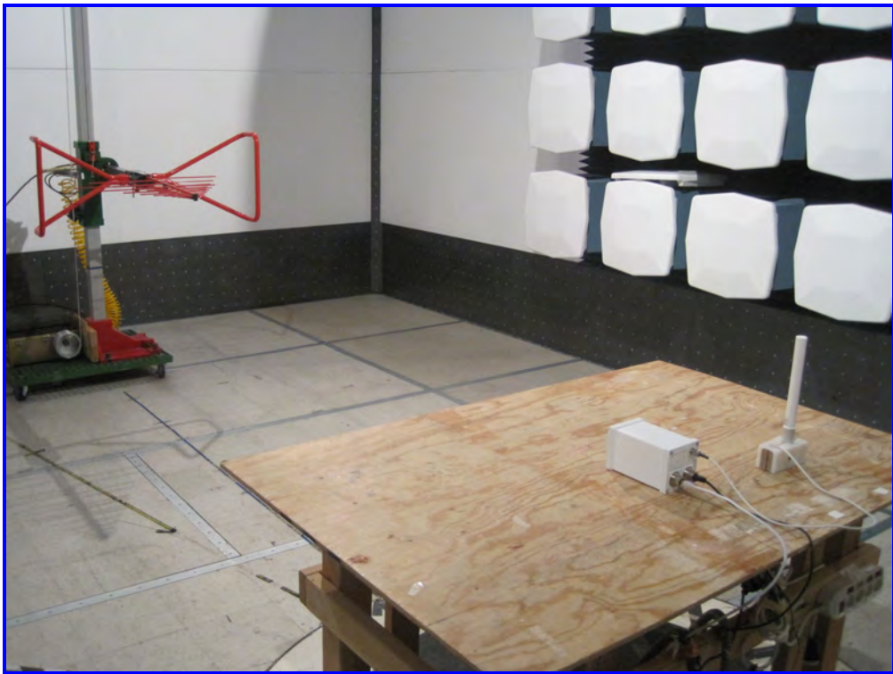
Radiated Emission, AIR-ANT2506 (30 MHz-1 GHz) – Rear View