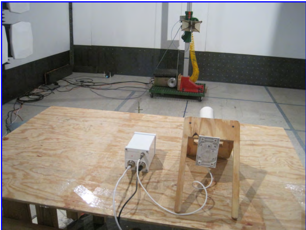
Radiated Emission, AIR-ANT1949 (Above 1 GHz) – Rear View