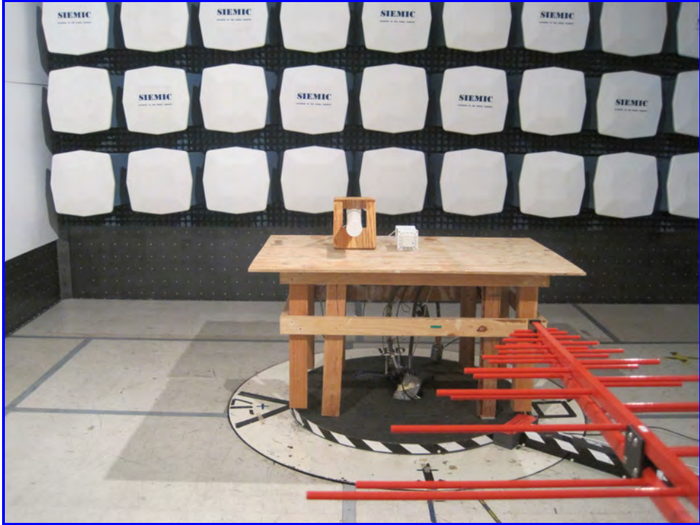
Radiated Emission, AIR-ANT1949 (30 MHz-1 GHz) – Front View