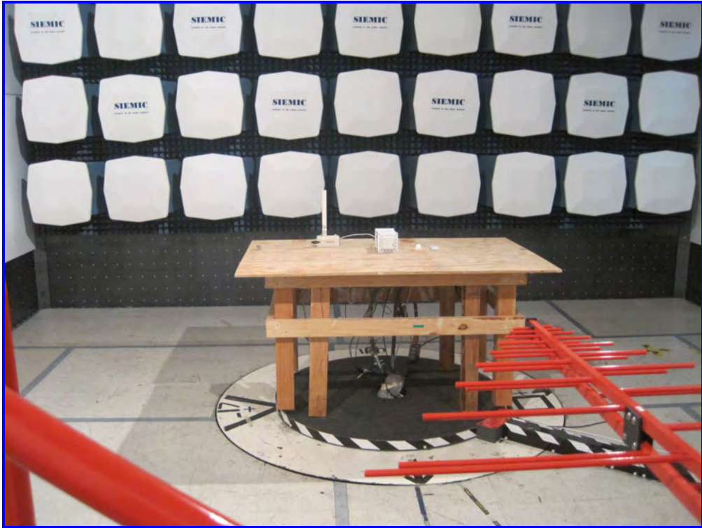
Radiated Emission, AIR-ANT2506 (30 MHz-1 GHz) – Front View