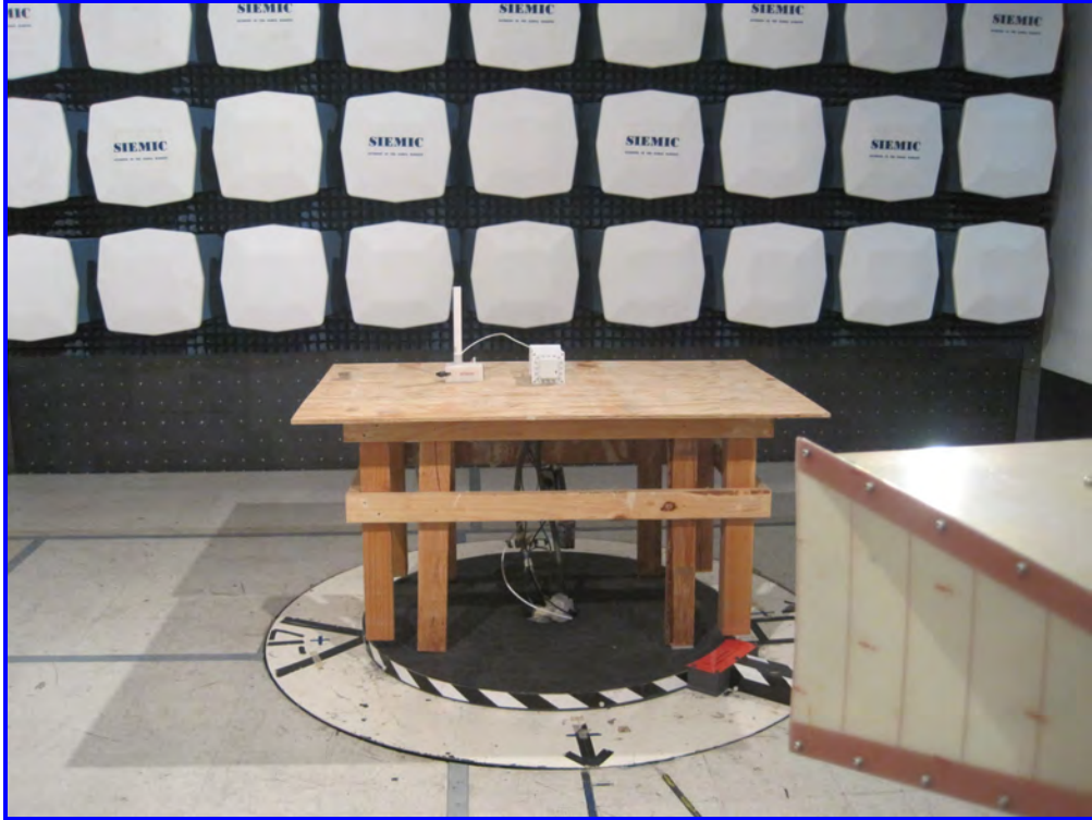
Radiated Emission, AIR-ANT2506 (Above 1 GHz) – Front View