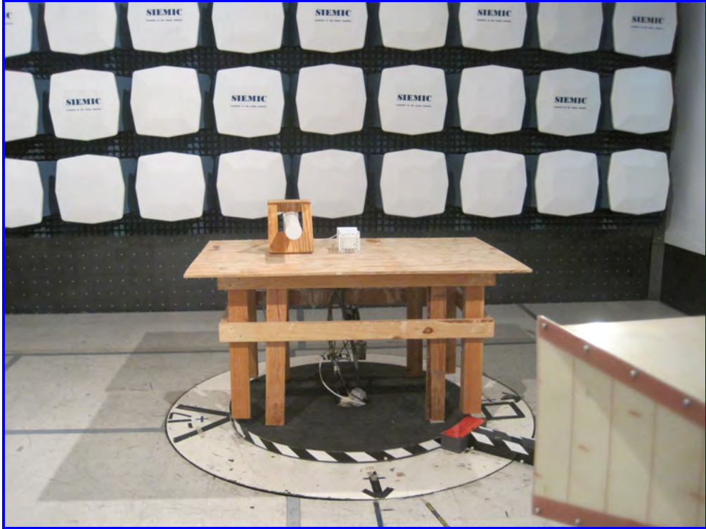
Radiated Emission, AIR-ANT1949 (Above 1 GHz) – Front View