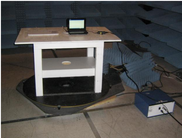
Figure 1 - Conducted measurements of CK3-15x containing PPxMnnWx30 host and CKW module.