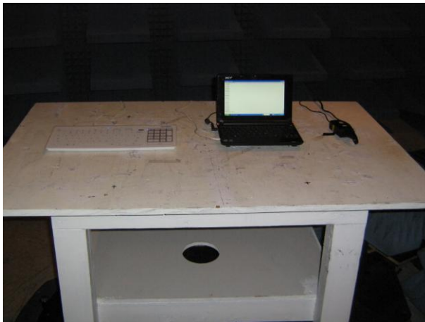
Figure 4 - Test setup for radiated emissions of CKW module with PPxMnnWx30 host.