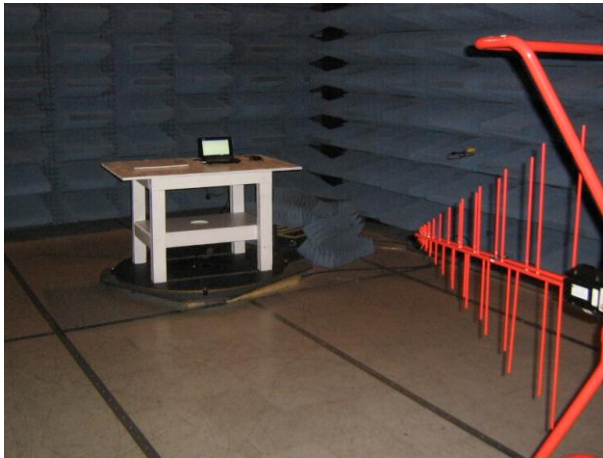
Figure 3 - Radiated measurements of CK3-15x containing PPxMnnWx30 host and CKW module.