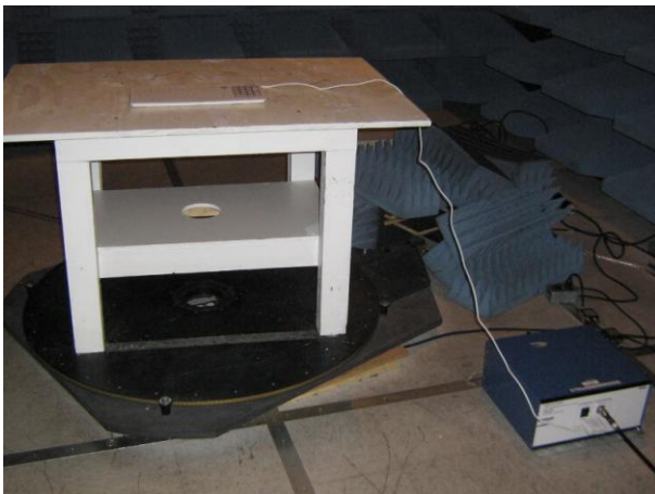
Figure 2 - Conducted measurements of CK3-15x containing PPxMnnWx30 host and CKW module.