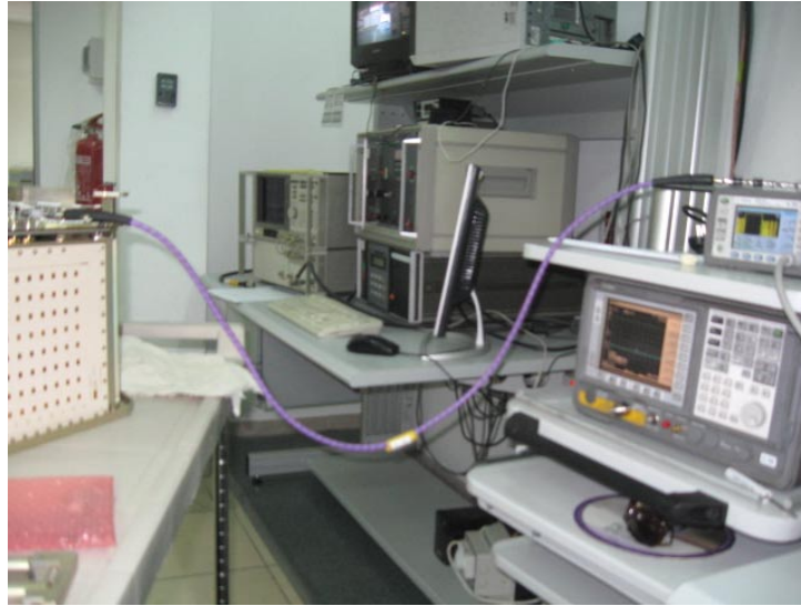
Photograph No.1 Peak output power, occupied bandwidth, emission mask measurement setup