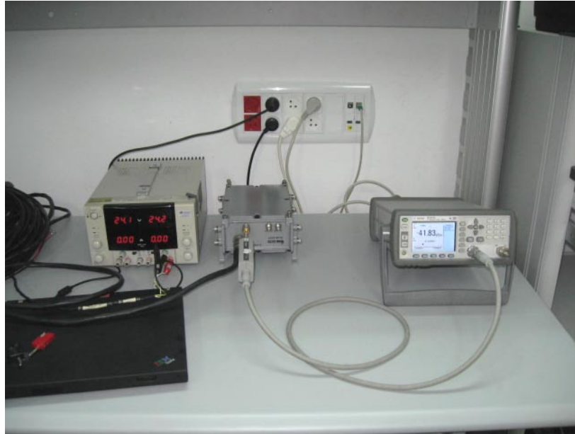
Photograph No.1 Peak output power measurement setup