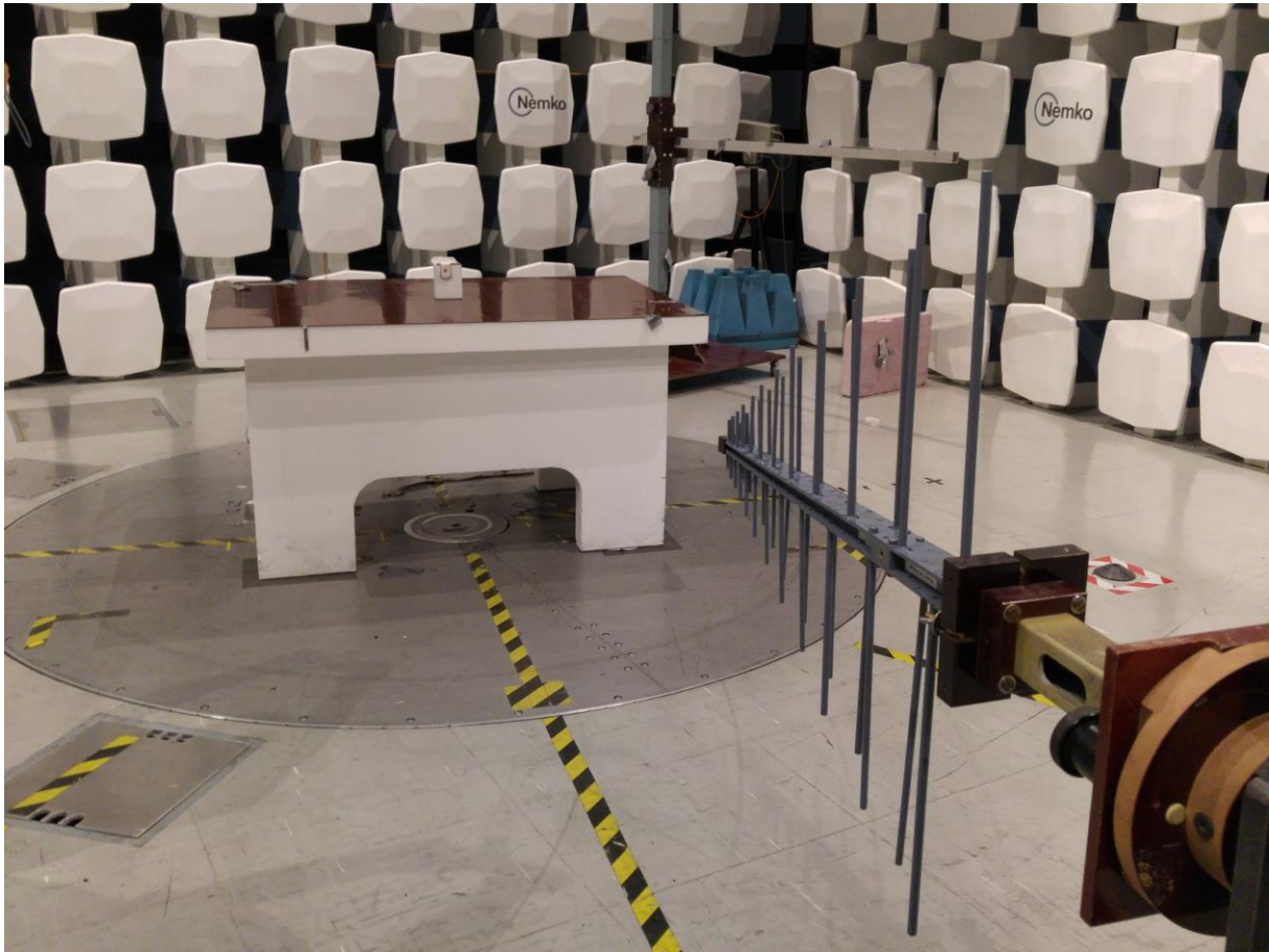
Radiated emissions, 200 -1000 MHz