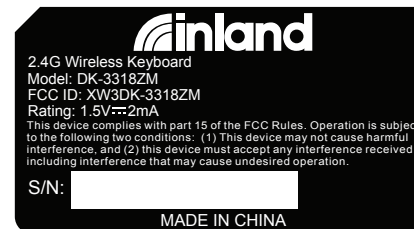
Label Die Line