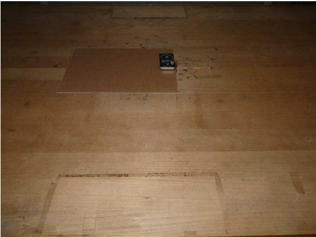
Photo 2: Test setup for radiated measurements (Enclosure, 30 MHz to 1 GHz)