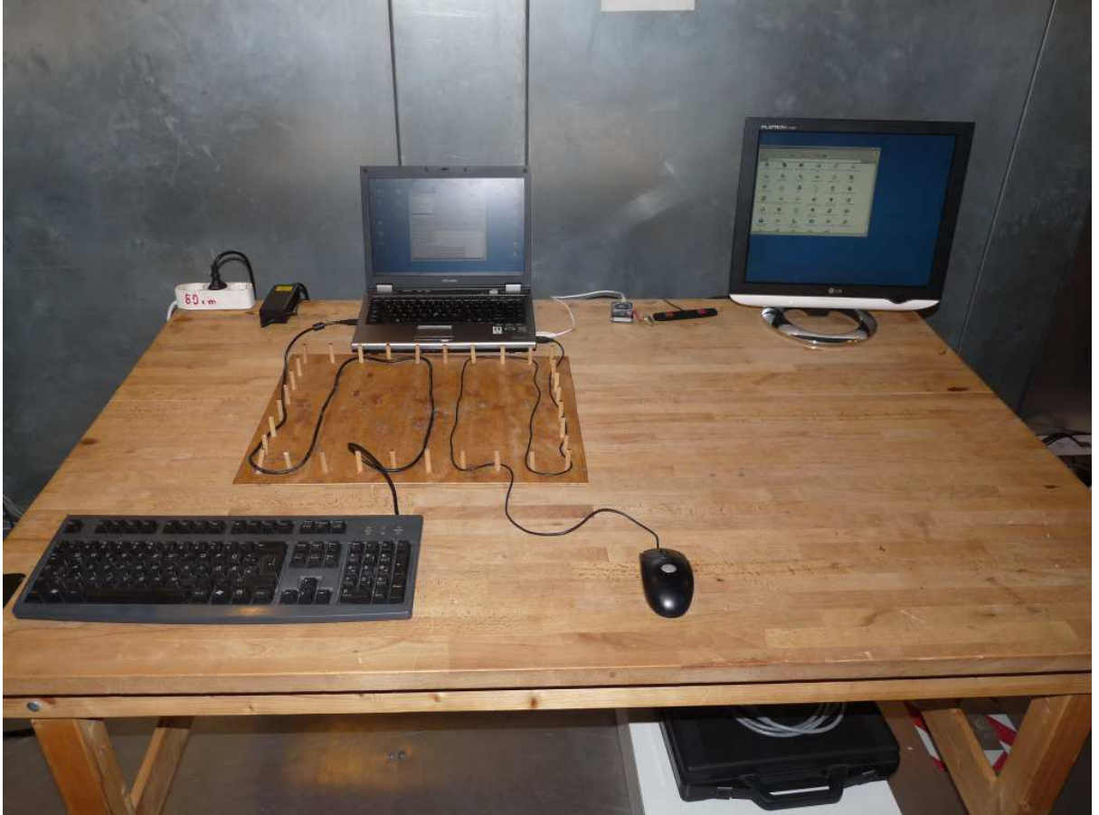
Test Setup Photo: conducted Tests