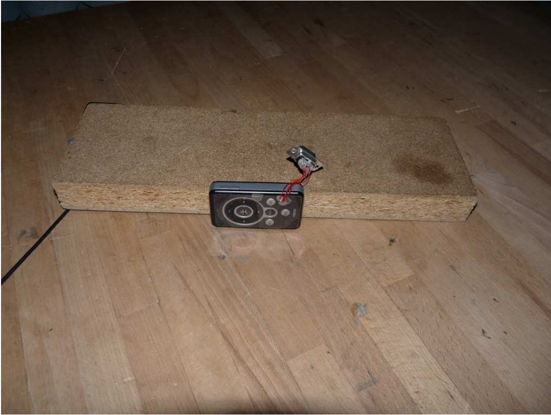
Photo 1: Test setup for radiated measurements (Enclosure, below 30 MHz)