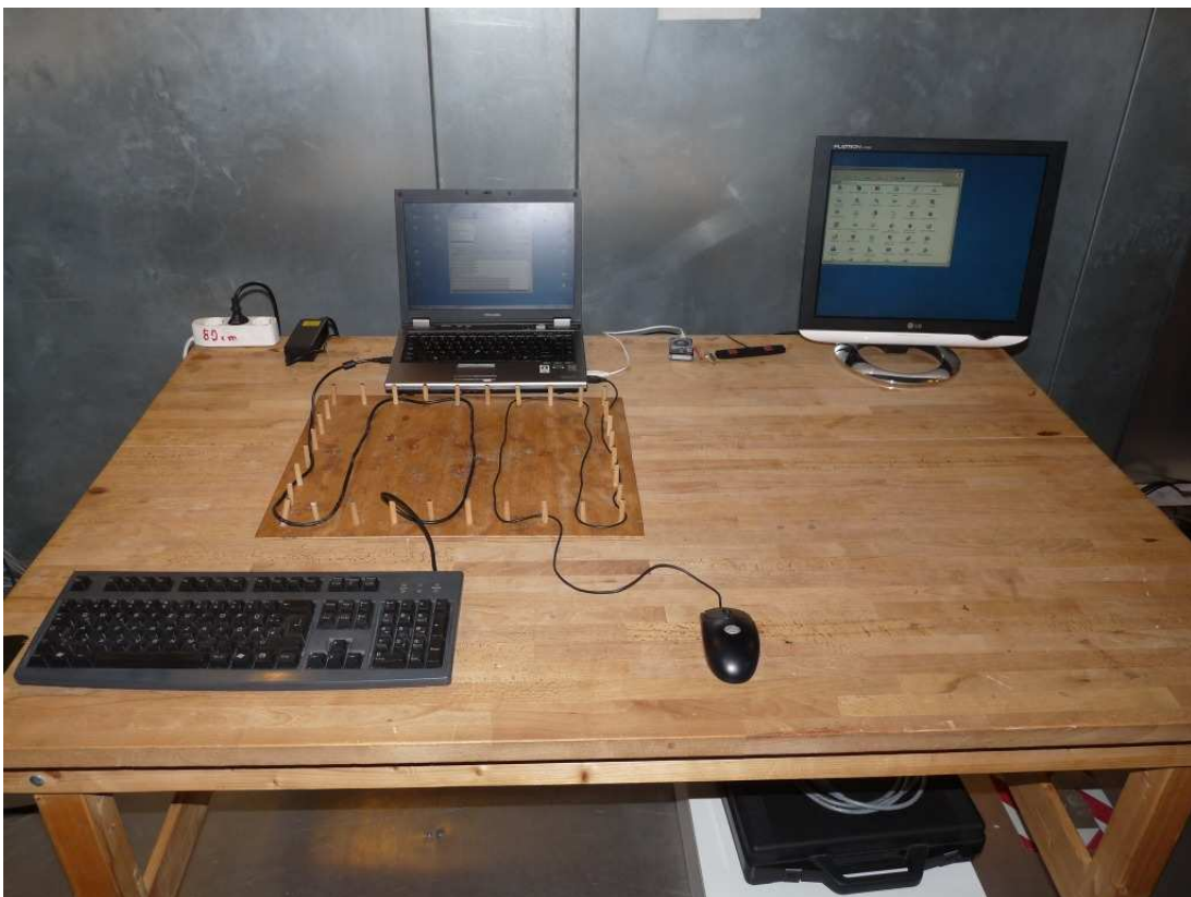
Photo 4: Test setup for conducted measurements (AC Port (power line))