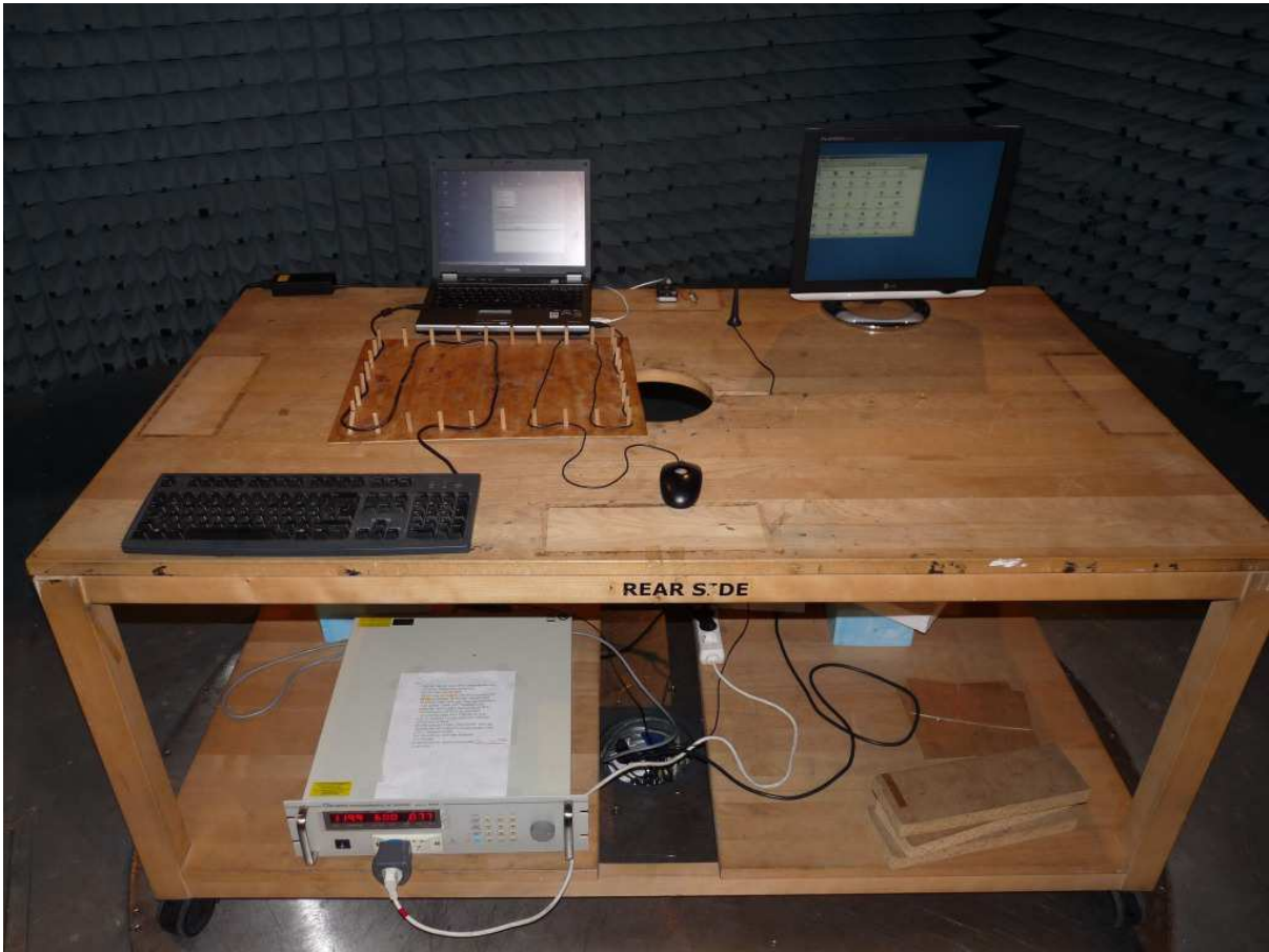
Test Setup Photo: radiated Tests