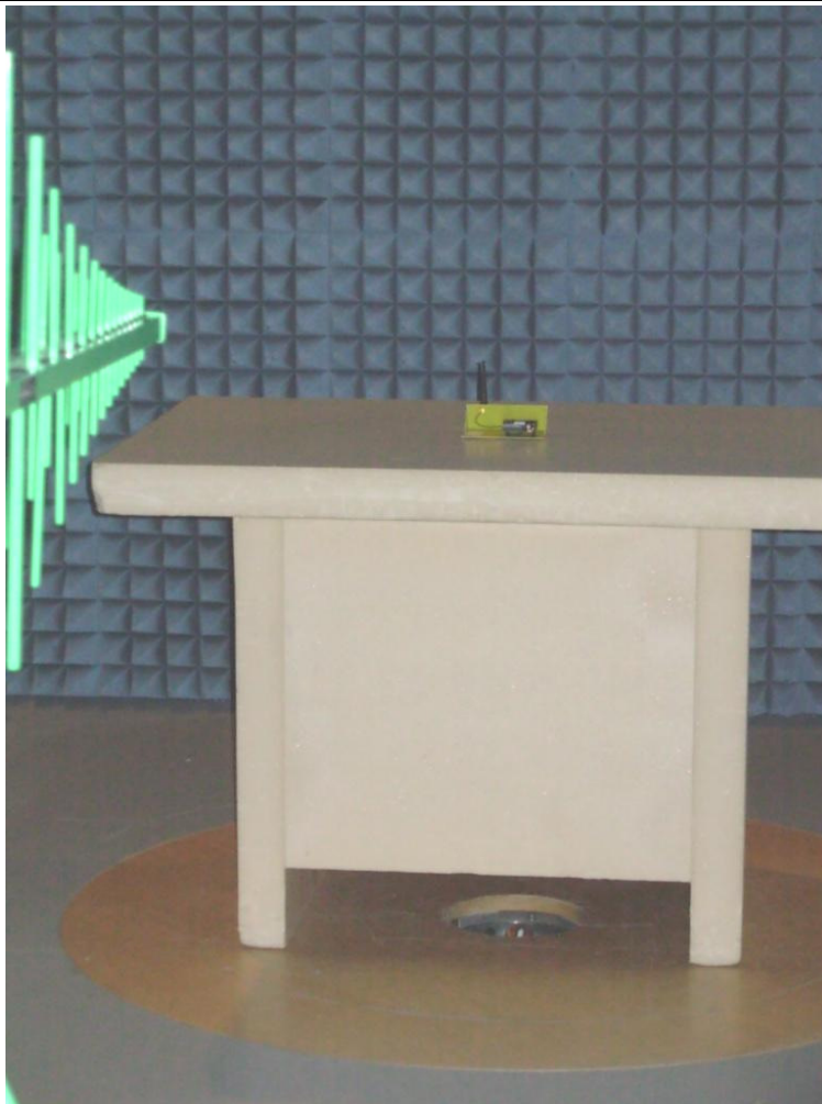
Figure 2: Measurement set-up for radiated measurement < 1 GHz acc. following sections of the report 1234-09-EE-10-PB005: 4.4.1 and 4.5.1