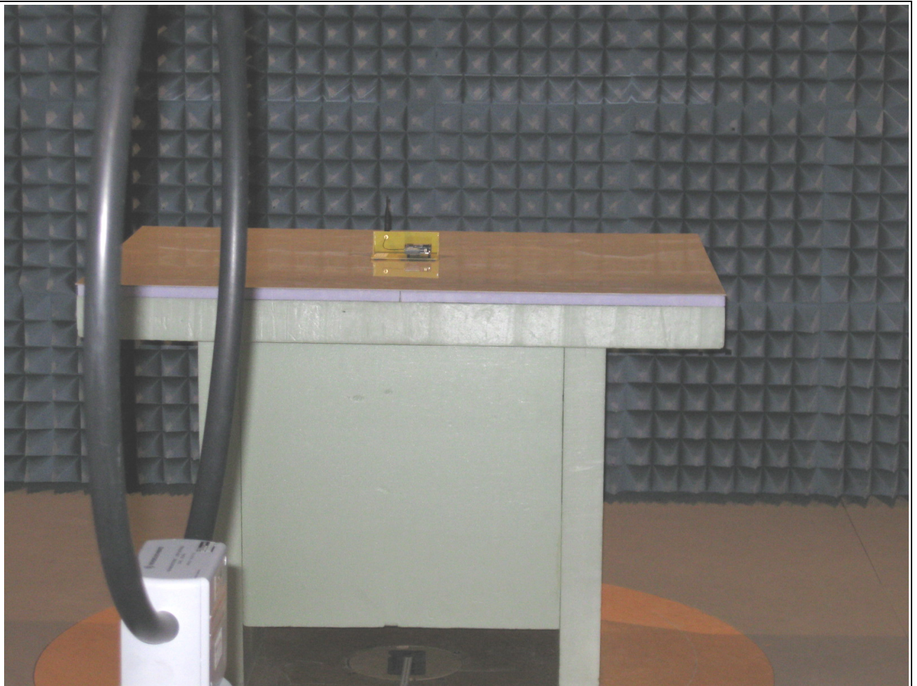
Figure 4: Measurement set-up for radiated measurement < 30 MHz acc. following sections of the report 1234-09-EE-10-PB005: 4.6