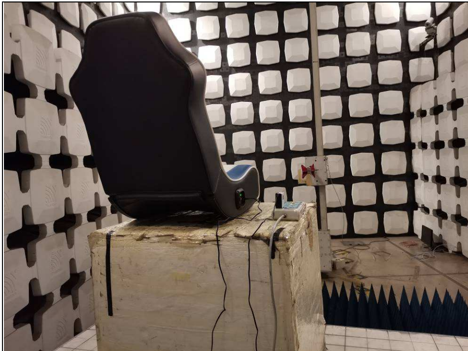
Frequency Range < Above 1GHz >