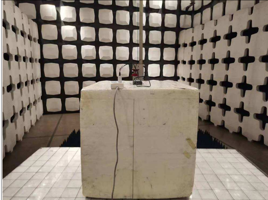
Frequency Range < Above 1GHz >