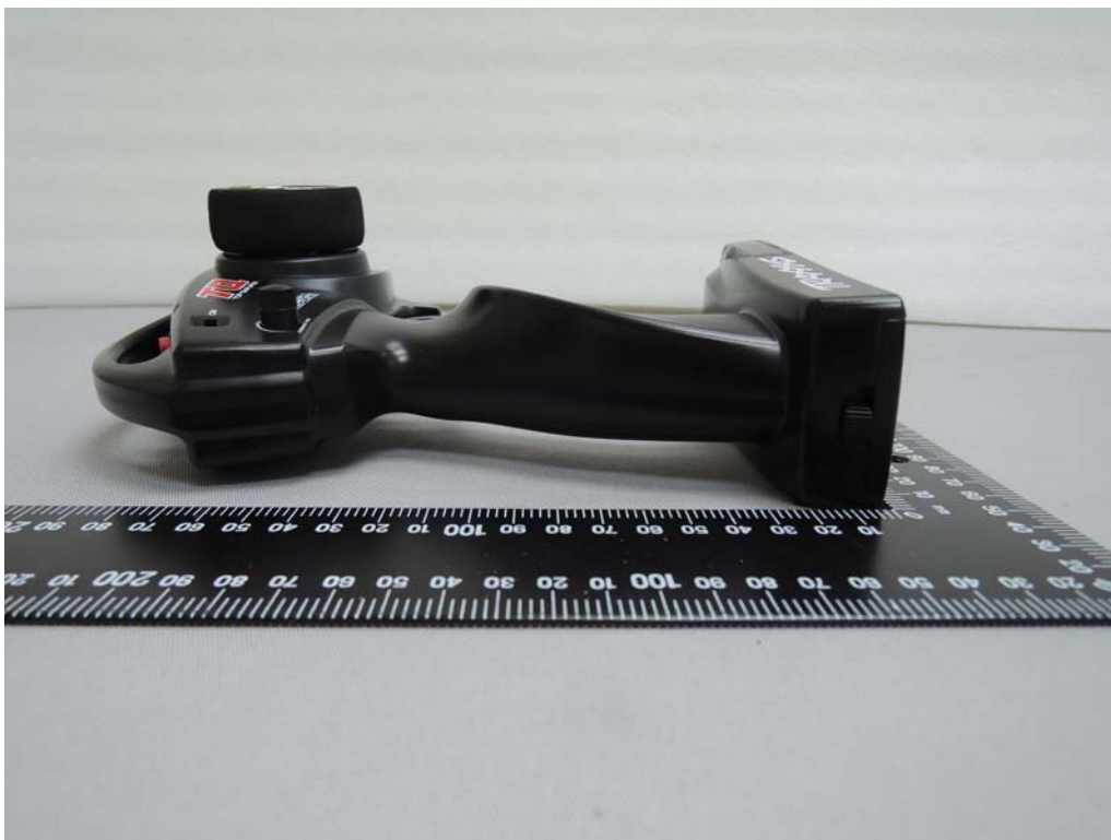
Front View of EUT (Model: 6516B)