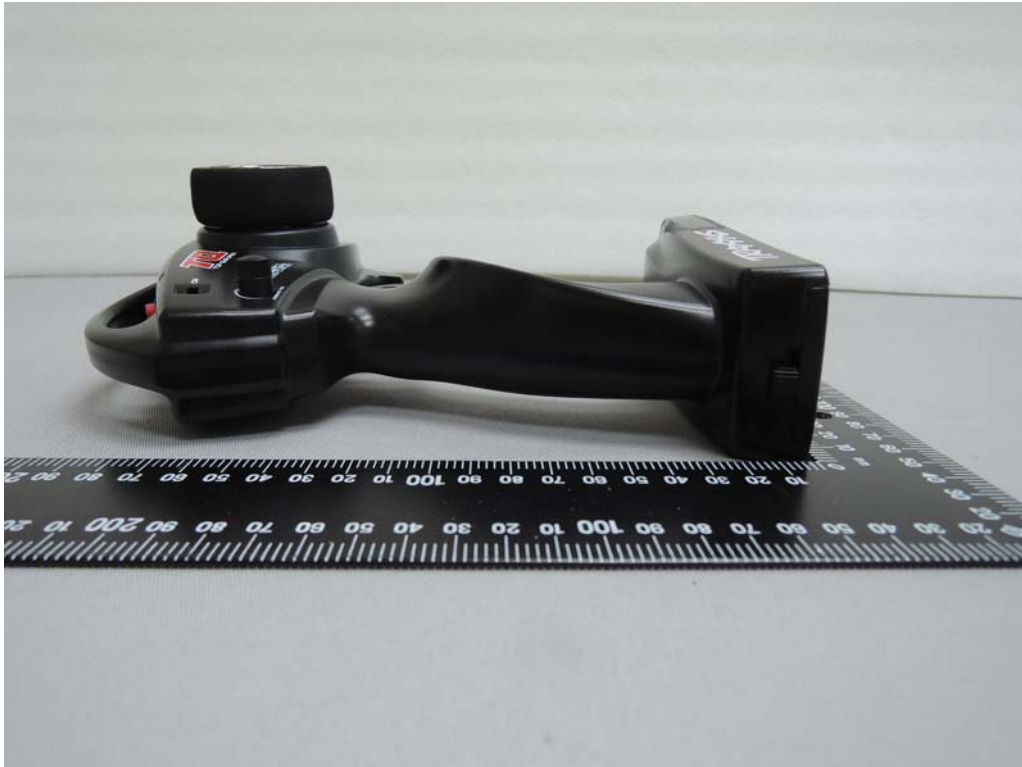
Front View of EUT (Model: 3047B)