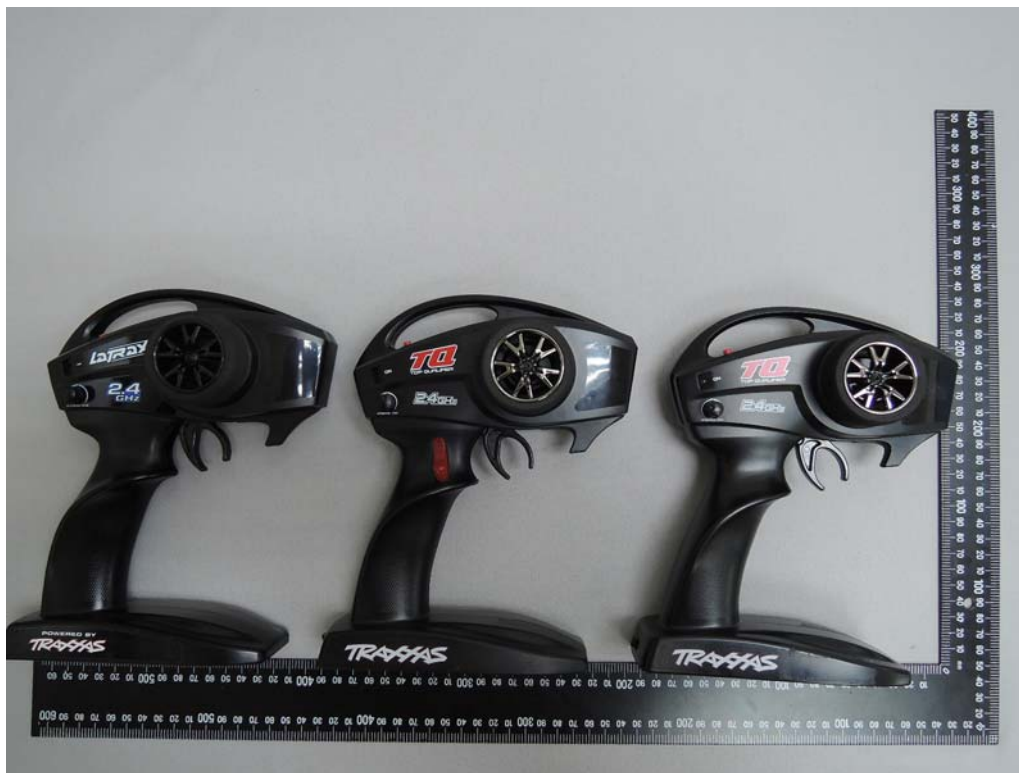
Front View of EUT (Model: 6517B)