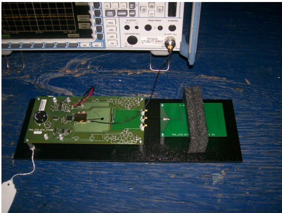
Conducted Emission (close)