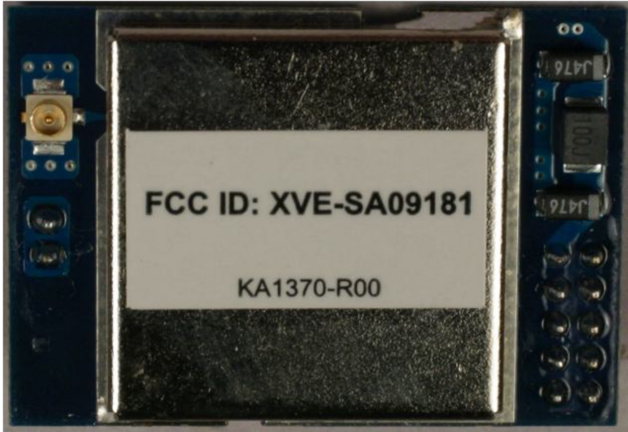
Figure 3 2.4GHz RF Module Top with RF can