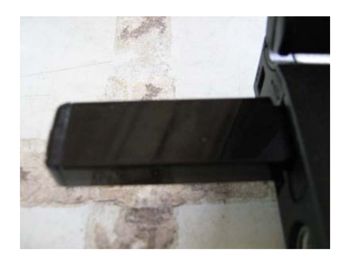
End of report