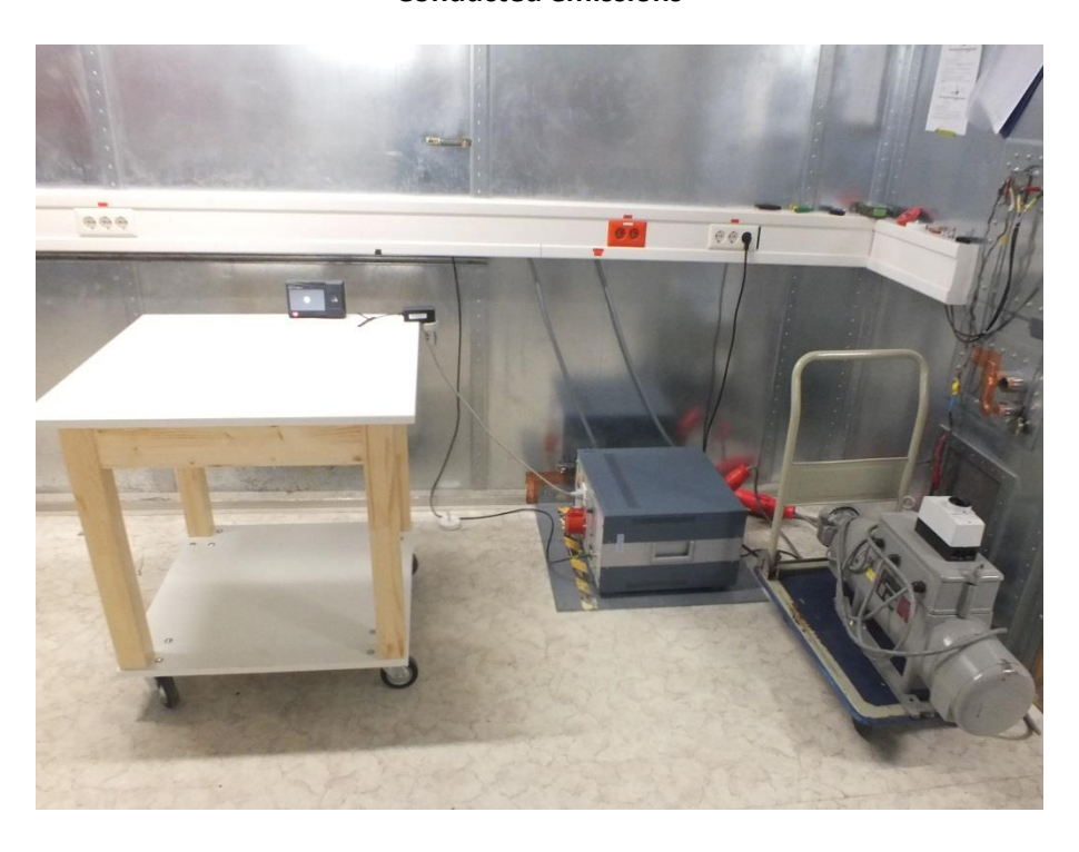
Field strength of the fundamental wave