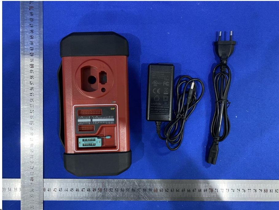
View of Product-1