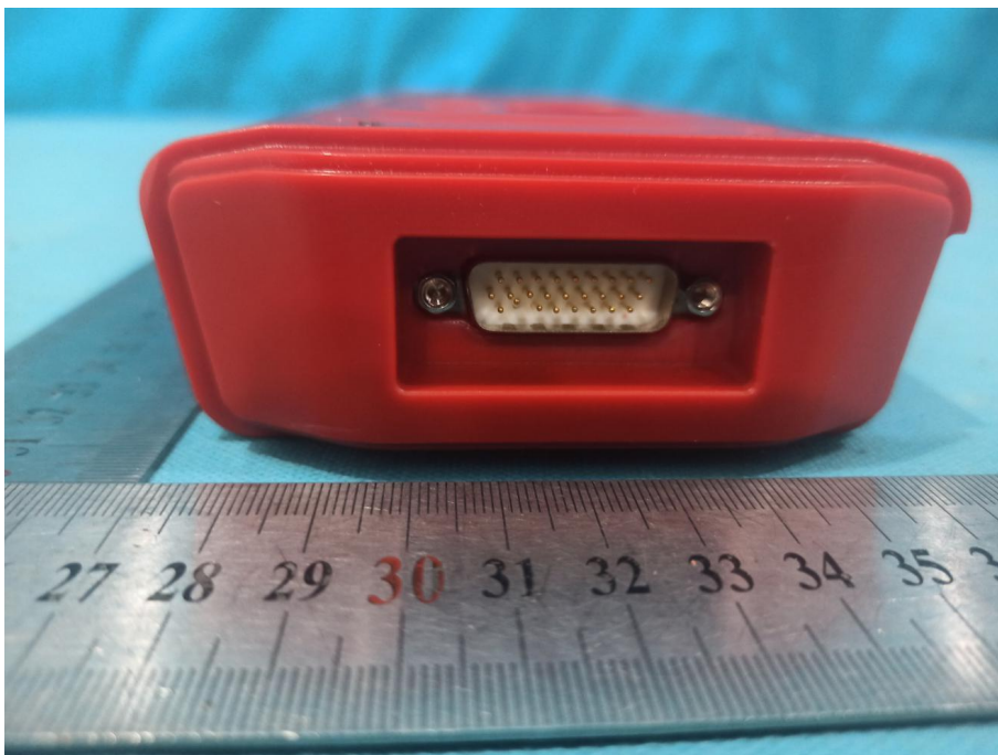
View of Product-6