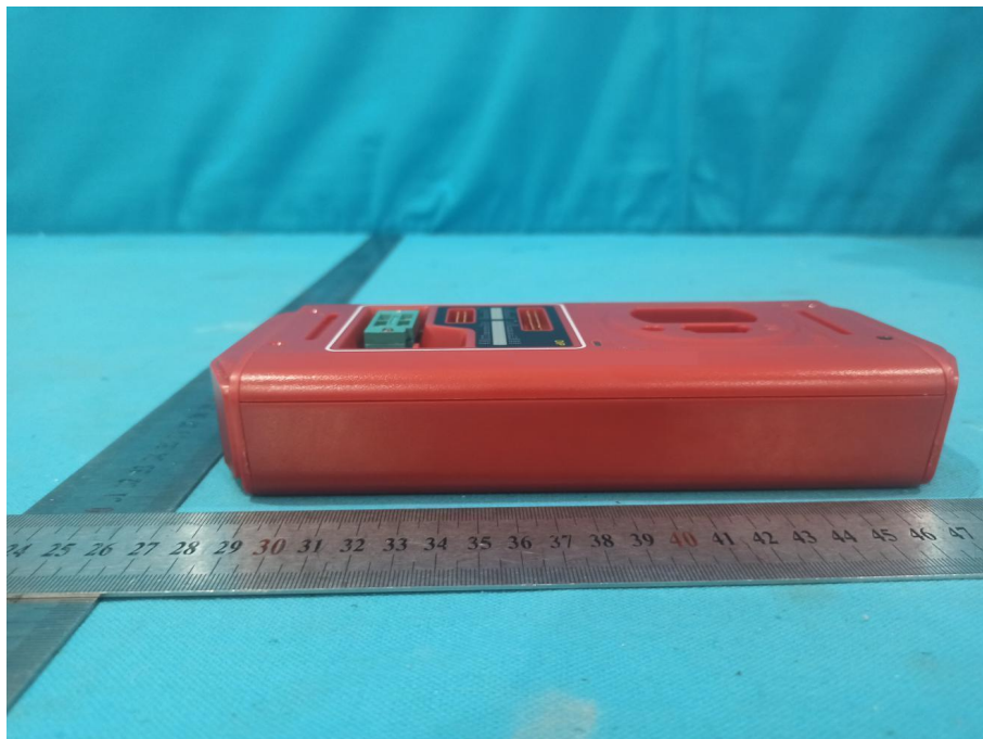
View of Product-4