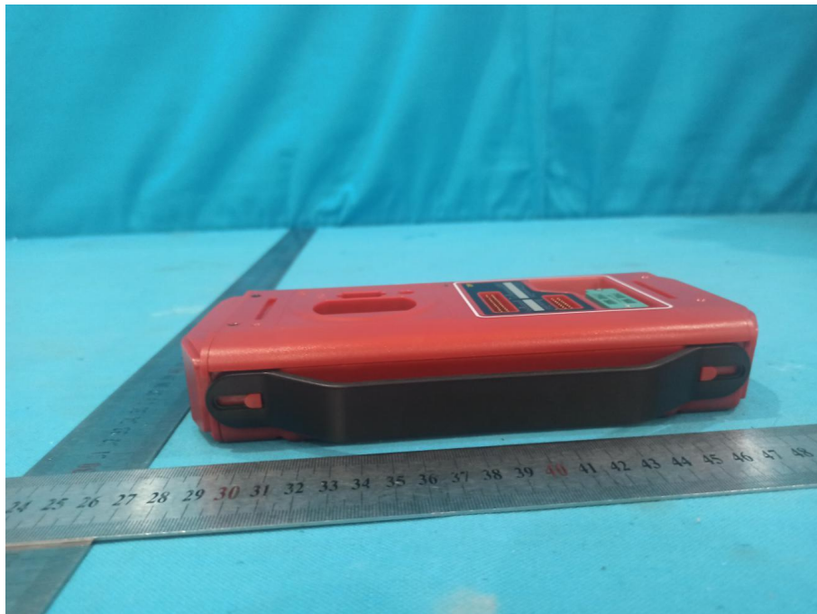
View of Product-2