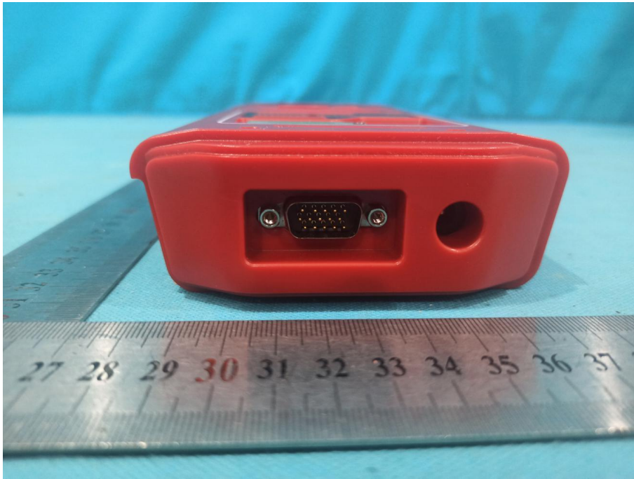
View of Product-5