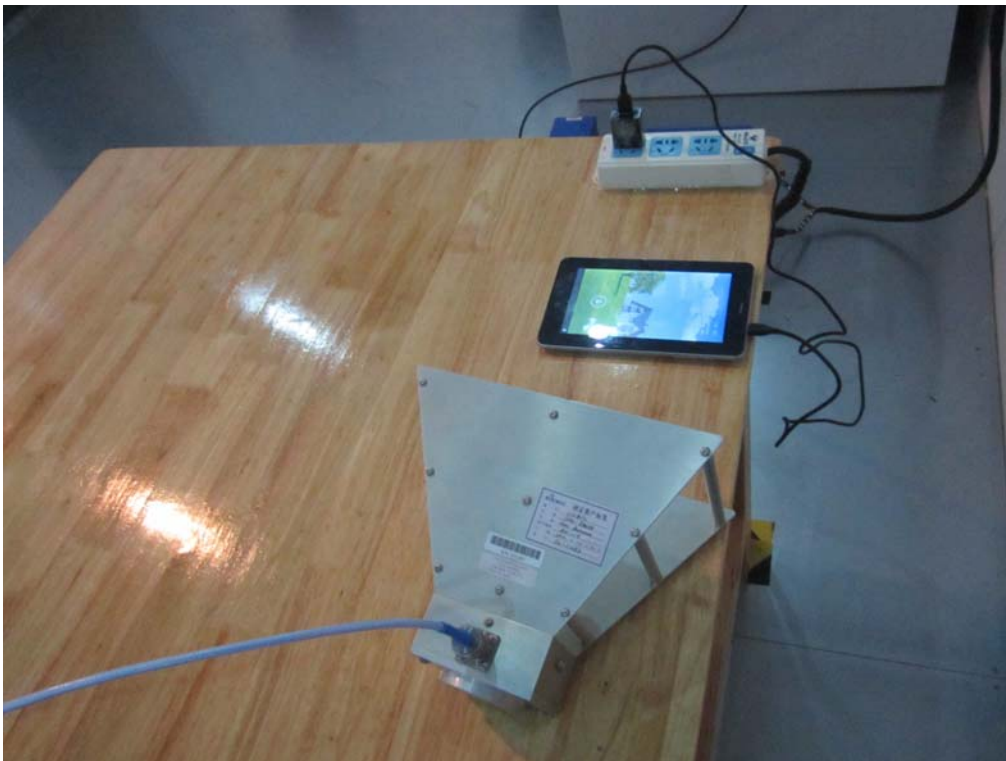
Conducted Emissions Test Setup Side View