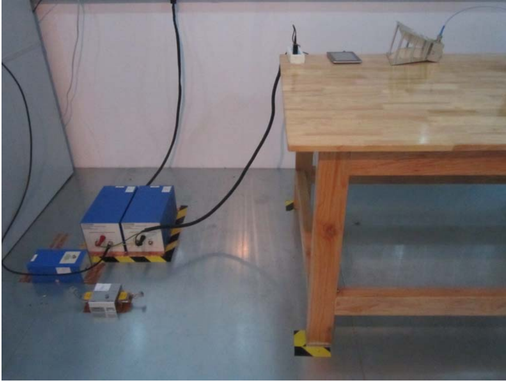
Conducted Emissions Test Setup Front View