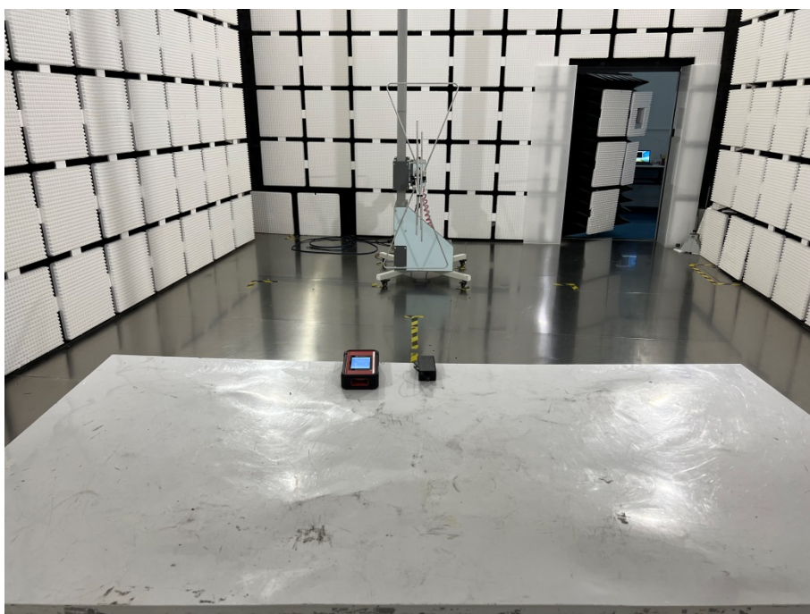
30MHz - 1GHz