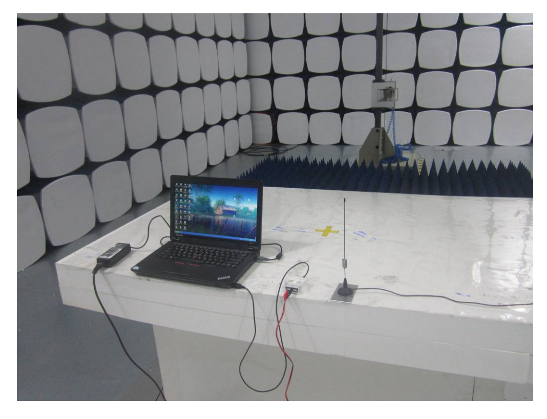
Radiated Spurious Emissions Test Setup Above 1GHz -Front View