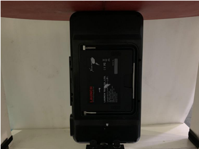
Left Side of EUT with 0 cm Gap