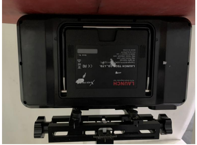
Bottom Face of EUT with 0 cm Gap