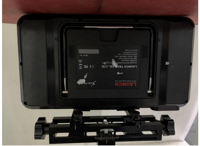
Bottom Face of EUT with 0 cm Gap