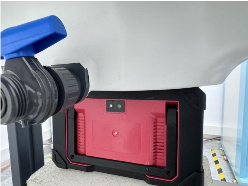
Body worn –Top (0mm)