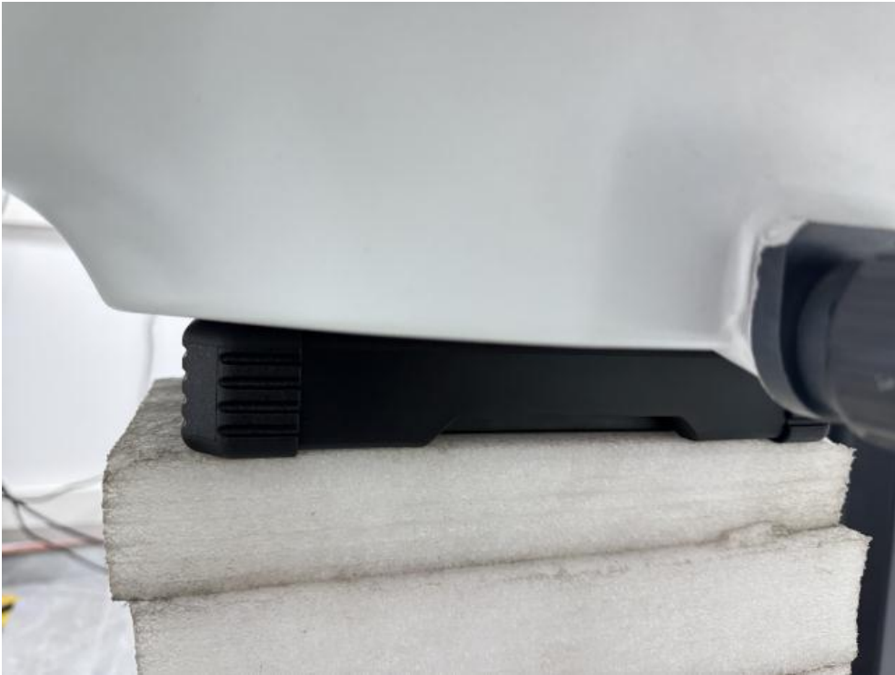
Body worn –Front (0mm)