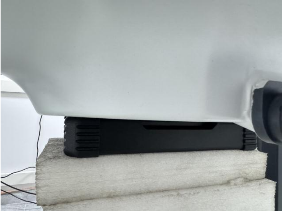
Body worn – Back (0mm)