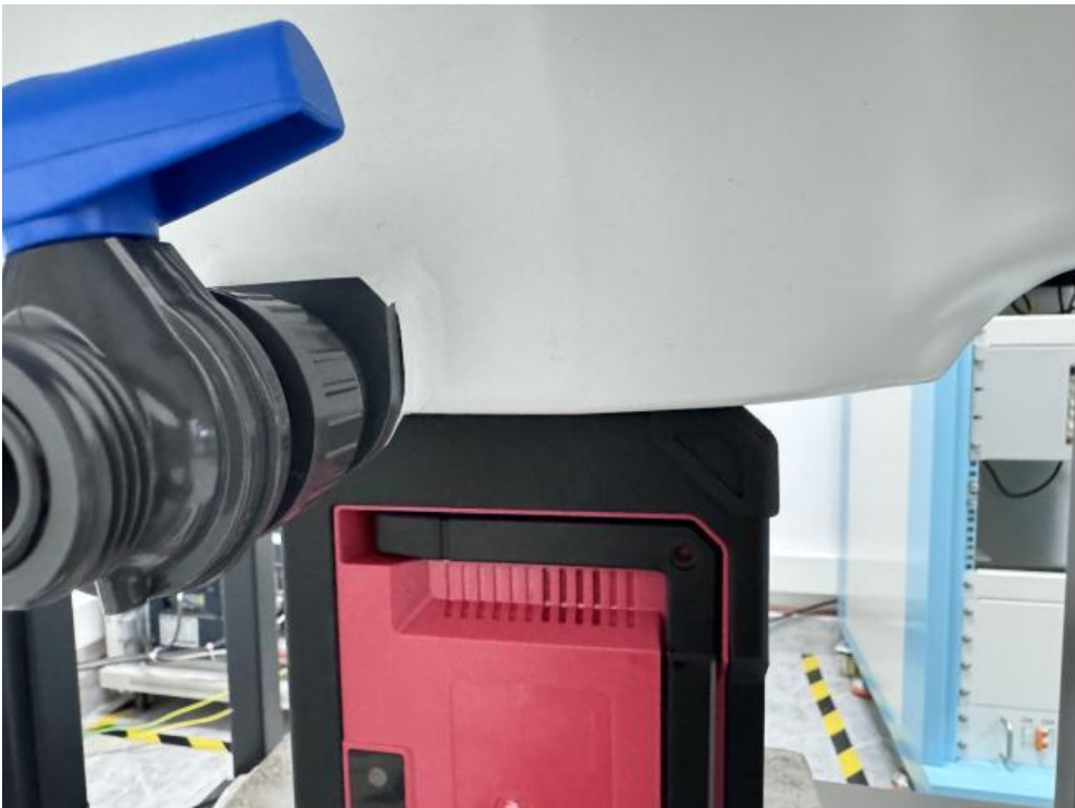
Body worn – Left(0mm)