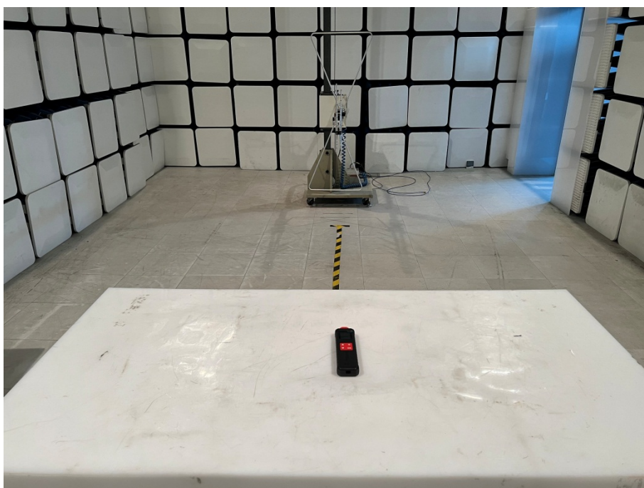
30MHz - 1GHz