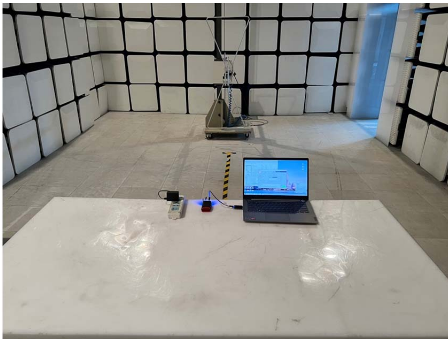
30MHz - 1GHz