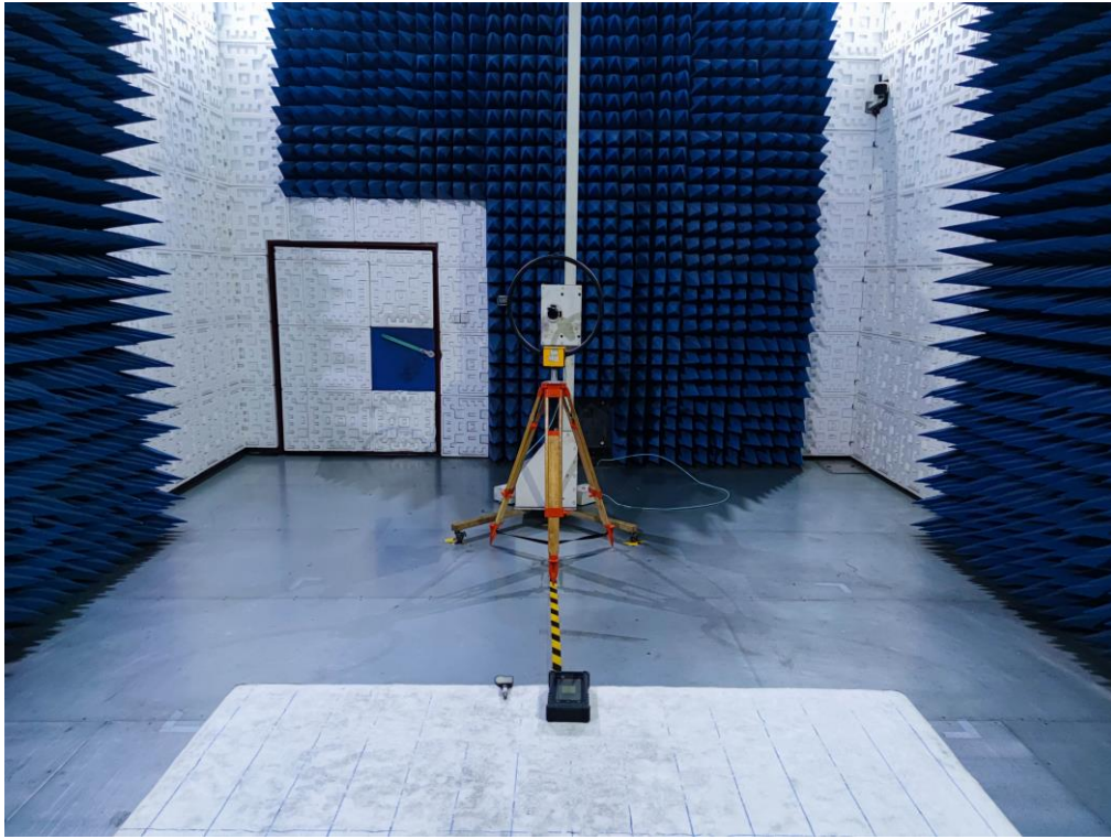
RADIATED EMISSION TEST SETUP BELOW 1GHz