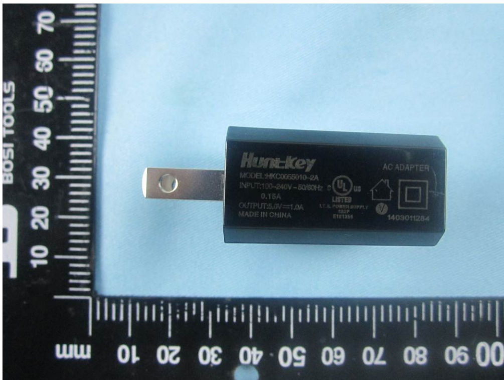
Adapter – Front View