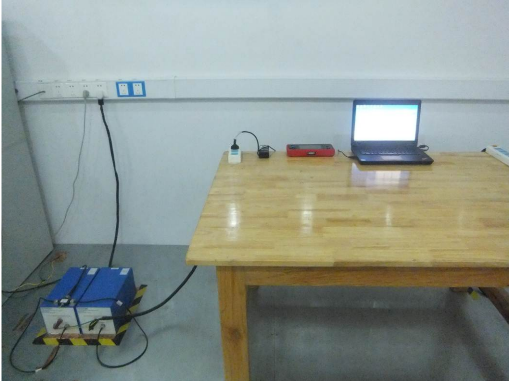
Conducted Emissions Test Setup Front View