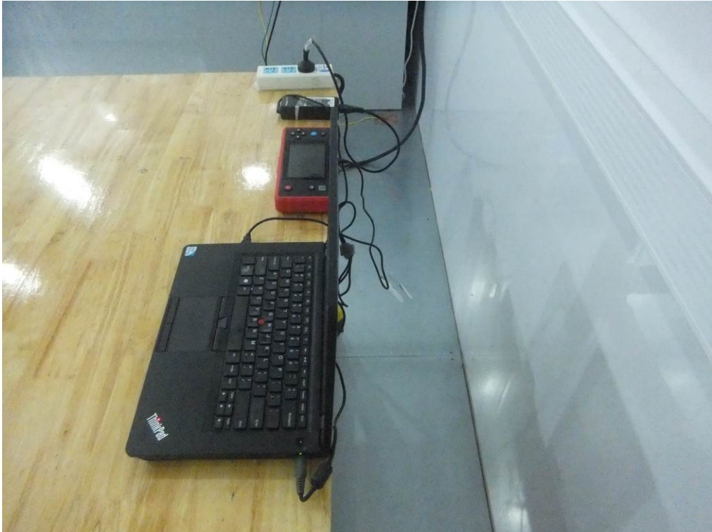
Conducted Emissions Test Setup Side View