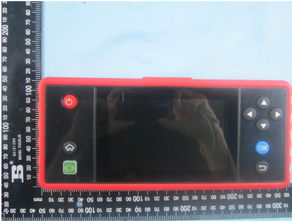
EUT - Front View

Report No.: 14070314-FCC-E1 Issue Date: September 28, 2014 Page: 20 of 36 www.siemic.com www.siemic.com.cn