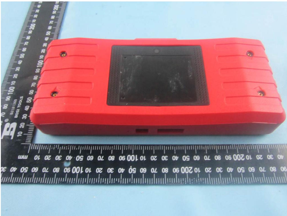
EUT - Bottom View