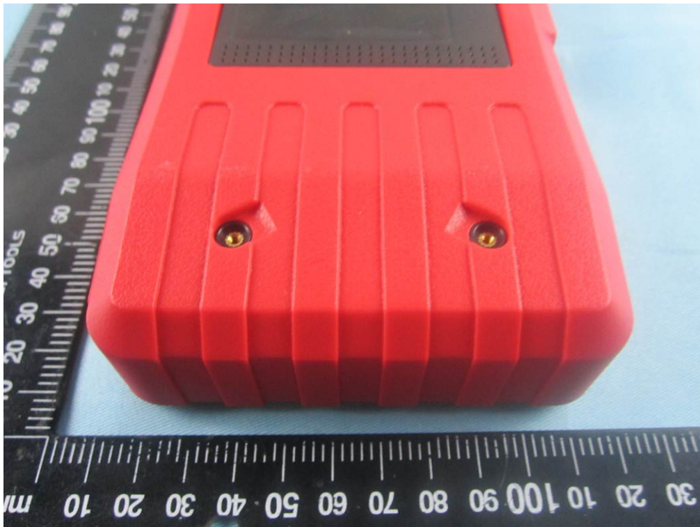
EUT - Right View