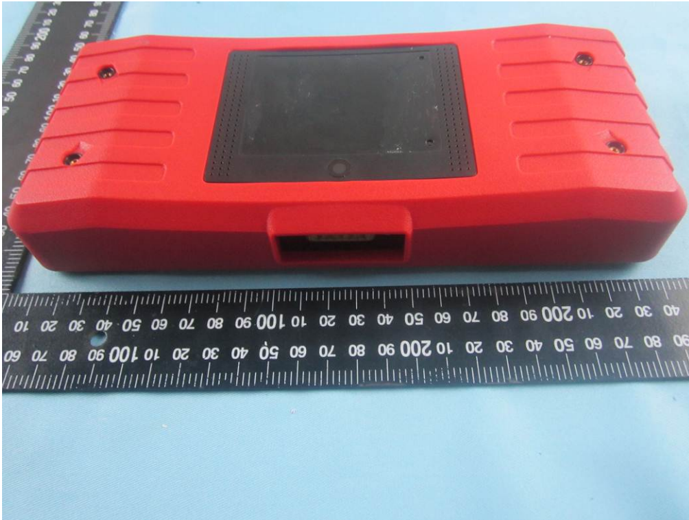
EUT - Top View

Report No.: 14070314-FCC-E1 Issue Date: September 28, 2014 Page: 21 of 36 www.siemic.com www.siemic.com.cn