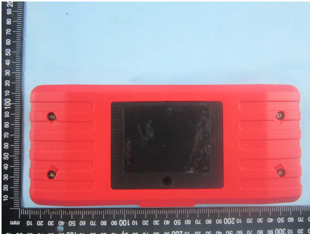
EUT - Rear View