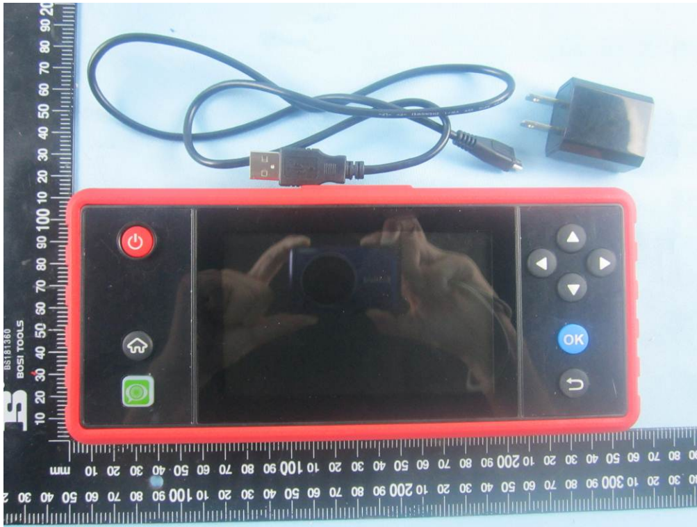
Whole Package - Top View