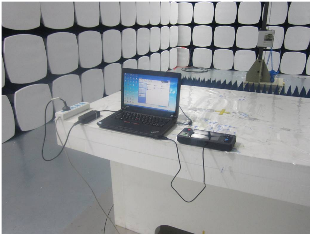
Radiated Spurious Emissions Test Setup Above 1GHz –Front View