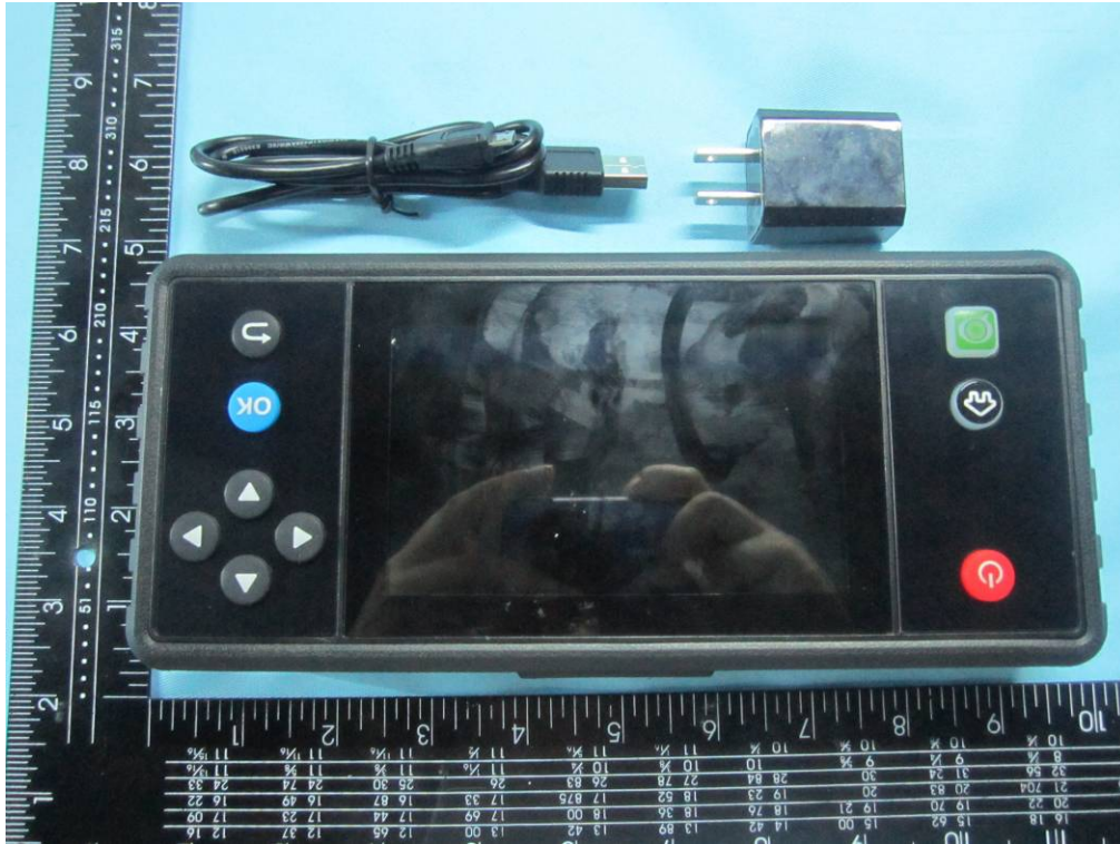
Whole Package - Top View