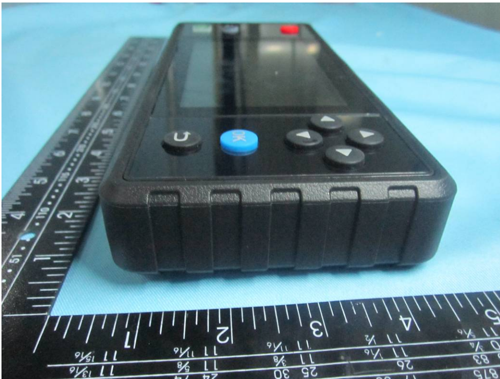
EUT - Right View