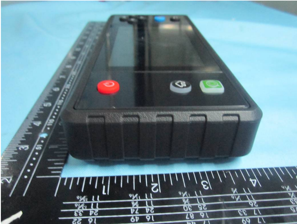
EUT - Left View

Report No.: 14070260-FCC-E1 Issue Date: Jun18, 2014 Page: 22 of 35 www.siemmic.com www.sinmic.com.cn