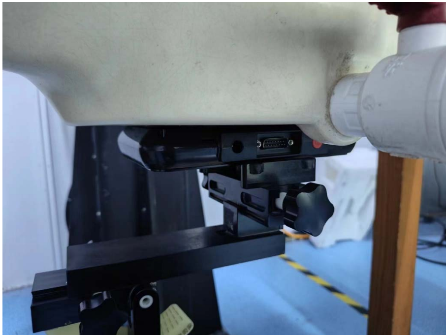
Body Back Setup Photo (0mm)