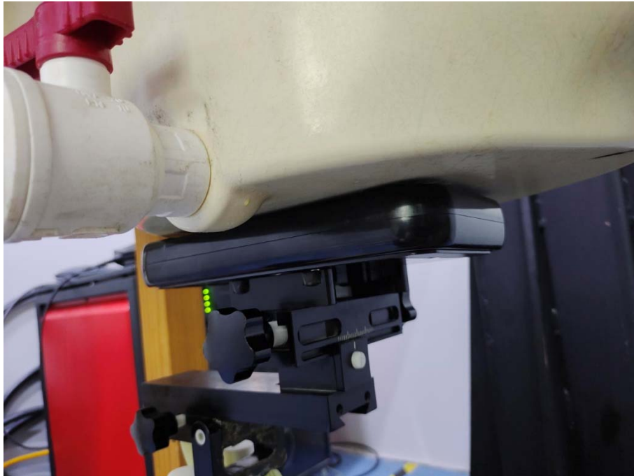
Body Left Setup Photo (0mm)